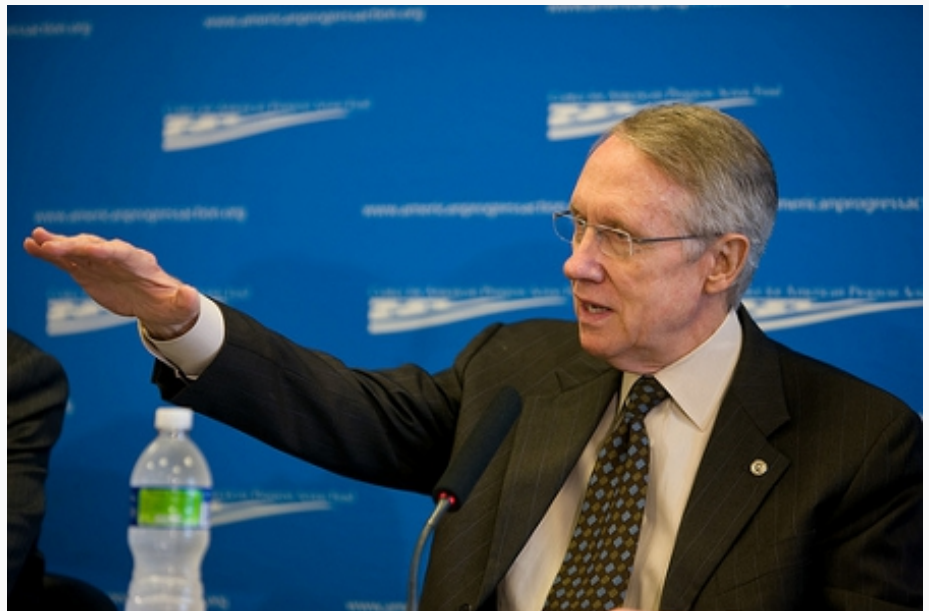
Senate Majority Leader Harry Reid

But if Mr. Reid schedules a vote, he risks Boggs being confirmed despite the vociferous objections of important Democratic constituencies and, perhaps, even the objections of a majority of his own party caucus. That is because it now takes only 51 senators to invoke cloture on judicial nominations—the result of Reid's decision last November to use the so-called “nuclear option” to eliminate filibusters on most judicial nominations . Republicans currently control 45 votes in the Senate; it is unclear how many Democrats would support Boggs, but in the post-nuclear Senate it would take only a handful of Democratic votes to permit Boggs to be confirmed. With more than two-dozen District Court nominations pending in the Senate, most of whom are supported by home-state senators, there may be incentives for some Democrats to support Boggs' nomination rather than risk retaliation when their