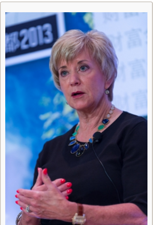
Linda McMahon

But, psychology also tells us this story might be more complicated. People need to be motivated before they will use stereotypes to make a negative judgment. This motivation often comes if people already dislike the person in question. Conversely, people are unlikely to use stereotypes to judge a person they like. So, if a voter actually likes a female candidate to begin