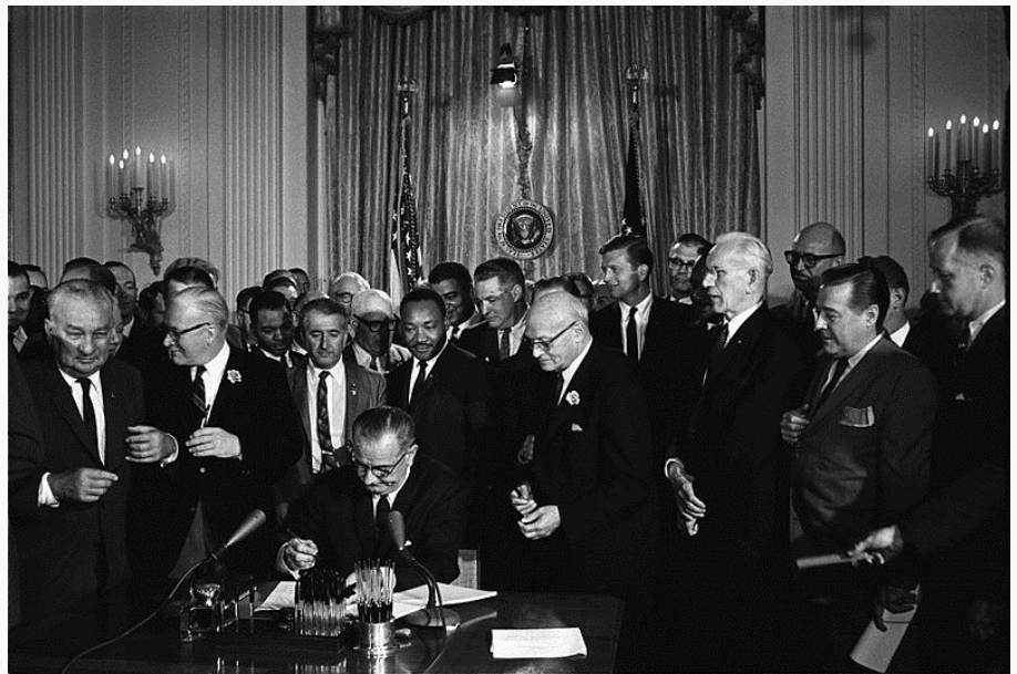
Lyndon B. Johnson signing the Civil Rights Act on July 2, 1964.

On the other hand, a separate line of empirical work has shown that tolerant racial norms have not erased racial negativity, but rather, racial animus has adapted to these norms. Racism is now subtle, or more implicit ; it is not driven by explicit beliefs about biological differences between whites and blacks, but rather, it is a function of persistent resentment .