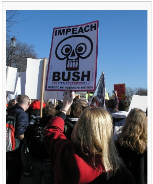
In the wake of U.S. involvement in Iraq, heavy media coverage of the war and strong opposition, meant some called for the impeachment of President George W. Bush

We focused on two institutional features that vary considerably across democracies: the extent of partisan opposition (number of parties in parliament or overall) and media access (TV, Radio). In our view, opposition produces independent political elites capable of whistleblowing, which makes it more likely that someone will bring to public attention a leader's foreign policy blunders. The efficacy of whistleblowing, however, is conditional on the public's access to the mass media as a conduit for communication between leaders and citizens. Absent a robust political opposition, information about foreign policy missteps will be unavailable to the media, and hence to citizens, who will therefore be in a poor position to punish the leader should the policy prove ill conceived. Absent broad public access to the media, the extent and credibility of the opposition matters little, as the public will fail to receive any messages that political elites might send. The implication is that without both robust opposition and widespread media access, democratic leaders are nearly as unconstrained as their autocratic counterparts and by extension have no credibility advantage either.