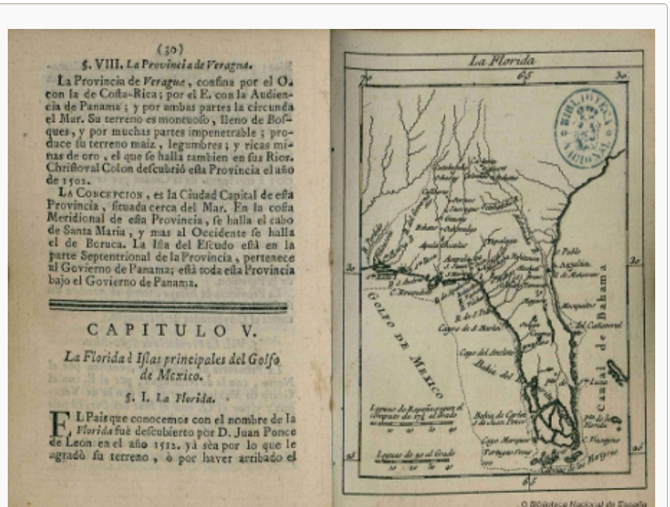
Map of Florida c1758

Well in a sense it means nothing, because Hispanic is one of those words people had imposed on them. I don’t think anybody in the United States thought of himself or herself as Hispanic until the 1960s when the U.S. government began telling people that’s what they were. It became a category, one of those boxes which you have to tick when you’re describing your ethnic identity for the Census or, probably more significantly, for employment purposes because institutions get brownie points if they respect the norms of diversity, and that means having as many people who don’t tick the ‘white Anglo-Saxon’ box as possible. So this idea, that you’re Hispanic, is kind of an official contrivance. Academics have substituted a label of their own invention, which is Latino, which is equally