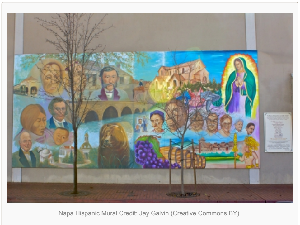
Napa Hispanic Mural

The only way the United States is going to remain wealthy, successful, buoyant, progressive, is by collaborating with other countries in its own hemisphere. There are lots of opinions about why the United States became a great power, and the really critical thing that many people overlook is that in the 19th century, the United States had access to enormous under-exploited resources. Above all, it had the Midwest; it had the American prairie, which was a desert until industrial products made it possible to farm it and to turn it into the breadbasket of the world. The United States doesn't have any under-exploited resources now; it's running out of oil, it's even running out of underground water.