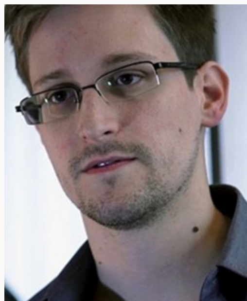
Edward Snowden.

In Nineteen Eighty-Four Winston is obliged to hide in order to write his own thoughts and he and Julia have to look out for