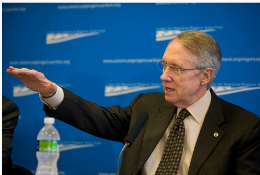
Senate Majority Leader, Harry Reid.

As the Senate grew due to the addition of new states to the union, and as the issues facing the country became more complicated, the number of filibusters in the chamber increased, as Figure 1 illustrates. By the early 20 th century, opposition to American participation in World War I led to then-unprecedented efforts to prevent passage of legislation. Senators' good will toward their colleagues frayed; President Wilson and his pro-war allies called