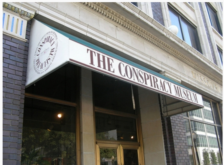
Museum of Conspiracies, Dallas, Texas.

After fifty years and little authoritative evidence, should so many continue to cling to JFK theories? As we move beyond November 22, 2013, the media focus will return to other more recent conspiracy theories. Our hope is that we can move past our predispositions and discuss them more civilly.