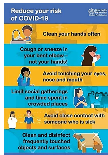
Fig 3: Image of Reduce risk of COVID-19

Ref: Image collected from Google images search