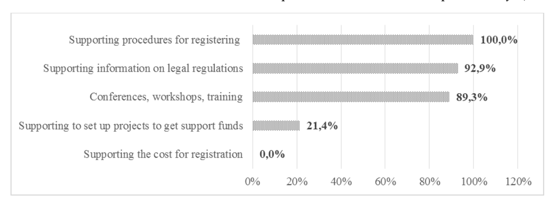
Figure 1. Survey results from collective mark owners on forms of supporting

According to the survey results (figure 1), the forms of support for building collective marks in Thua Thien Hue province are supporting procedures for registering collective marks (100%), supporting information on legal regulations on collective marks (92.9%), conferences, workshops, training on collective marks (83.9%), supporting to set up projects to get support funds from the intellectual property development program (21.4%). In particular, no collective trademarks of any village products of Thua Thien Hue province were supported by collective mark registration funds (in fact, the People's Committee of Thua Thien Hue province has a plan to support a part of the costs for registering the collective trademark "Mè xửng Huê" in Thailand at a cost of VND 40 million; however, up to now, it has not been implemented yet).