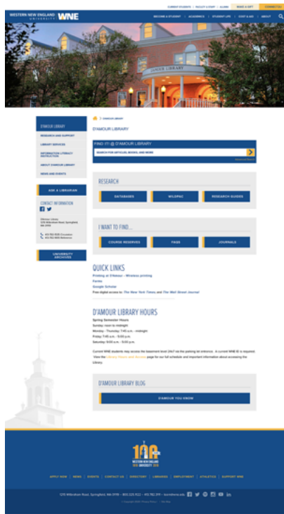
Homepage of the D’Amour Library website.

peatable and two of them impossible. For the most part, we didn’t have any difficulty thinking of tasks for participants to accomplish. It was, however, difficult to keep to