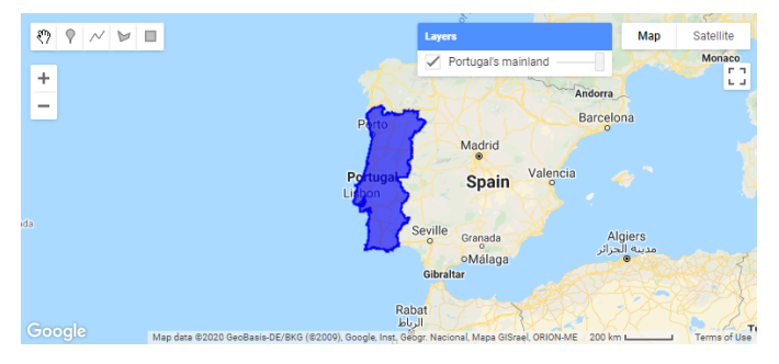
Fig. 7: Google maps pane in the Code Editor showing Portugal's mainland boundaries in blue.

Consider the script in Listing 19, it will draw a layer in the Google Maps pane with the territorial boundaries of the Portuguese mainland. The geometry is drawn in blue and the result would be similar to the one in Figure 7.