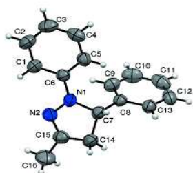
Fig. 2: ORTEP diagram of 3b with 50% probability ellipsoids

The mass spectrum of all the synthesised compounds showed M+1 molecular ion peak corresponding to its molecular formula which confirmed the formation of these compounds. In ^{13}\text{C} NMR spectrum of compound (3b), a signal at 15.99 ppm is assigned to methyl carbon attached to pyrazoline ring at C3. Two signals at 47.74 and 63.75 ppm are assigned to C4 and C5 respectively. One signal at 146.04 ppm is attributed to C3 carbon in the pyrazoline ring. A collection of signals appeared in the region 112.97-149.58 ppm which are ambiguously assigned to aryl carbons. The physical and analytical data; ^1\text{H} NMR and ^{13}\text{C} NMR chemical shifts of synthesised compounds (3a-g) are summarized in Table-1, Table-2 and Table-3 respectively.