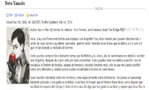
Figure 7. Noto Yamato's profile.