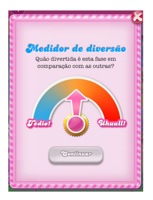
Figure 5. Fun-O-Meter. From Fun-O-Meter (n.d.). Translation: "Fun-O-Meter: was this stage as fun as the previous one?"

Babi Dewet, or @babidewet, is an example of fanfictioner; she has published books that derived from reviews and publications for fans of McFly, a British band. She is currently 30 years old and is very active in social media, publishing texts and interacting with other young people with common interests.