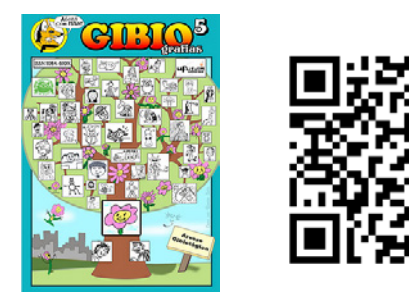
Figure 6. GibioZine's print cover and digital version – UFSCAR. Retrieved February 16, 2017 from http://gibiozine.wixsite.com/gibiozine

The following figure reproduces the digital and printed cover of GibioZine, from Biology Course at Federal University of São Carlos (UFSCar), Sorocaba/SP. It was created ten years ago, by Biology professors and students, with the purpose of disseminating texts about scientific, biological concepts. Recently, they have published GibioZine's 15th edition.