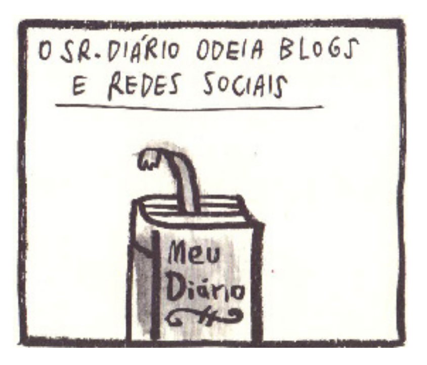
Figure 2. Emergence of new modalities of reading and writing From Sieber (2014: 37). Translation: "Mr. Diary hates blogs and social networks."

As Figure 2 illustrates, by means of the emergency of new reading and writing modalities, a paper diary is not enough to record people's secrets and experiences anymore: