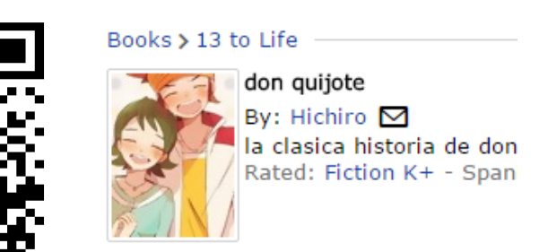
Figure 9. Hichiro's profile.

Fanfictioner Hichiro (Figure 09) also wrote a fanfiction based on Don Quijote de La Mancha , but he chose to keep a prose genre: