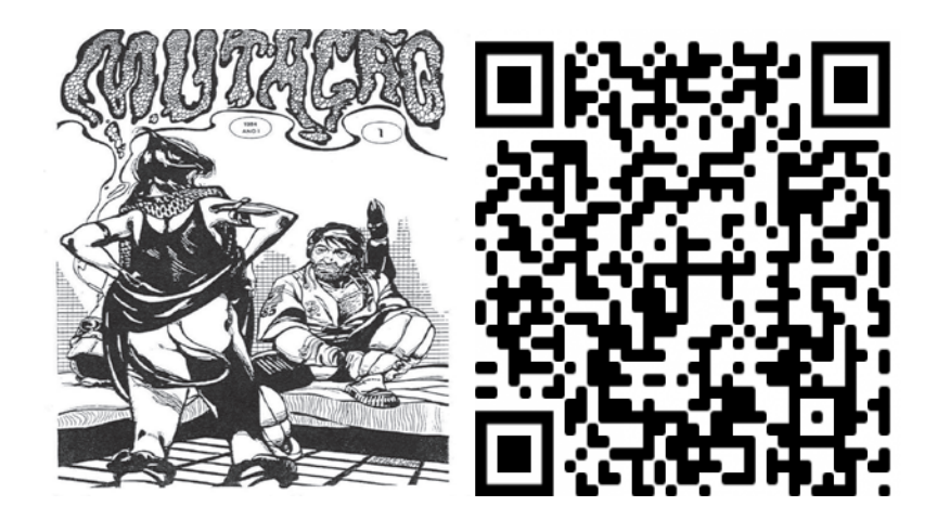
Figure 4. First cover of the "Mutação" fanzine, by Marco Muller (1984), and it's current edition.

Fanzines represented a generation, and served as a way of protesting against the publishing market. Figure 04 shows the cover of the first edition of the "Mutação" ("Mutation") fanzine, from 1984. It is still published in Brazil.