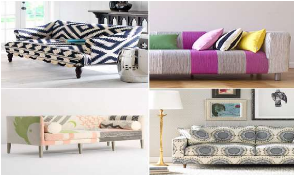
Fig.1 –The art of textile pattern in feature of upholstered furniture.

When the repetition of the motive or motives is constantly in one direction between two real or imaginary parallel lines, the pattern we get is called ridged pattern. Synonyms are stripped pattern, one-dimensional pattern, ornament liners or frieze groups. If repetition of the motive or motives in two independent directions the covers surface is called surface tread pattern. Synonyms wallpaper pattern, a periodic pattern or crystallographic pattern.