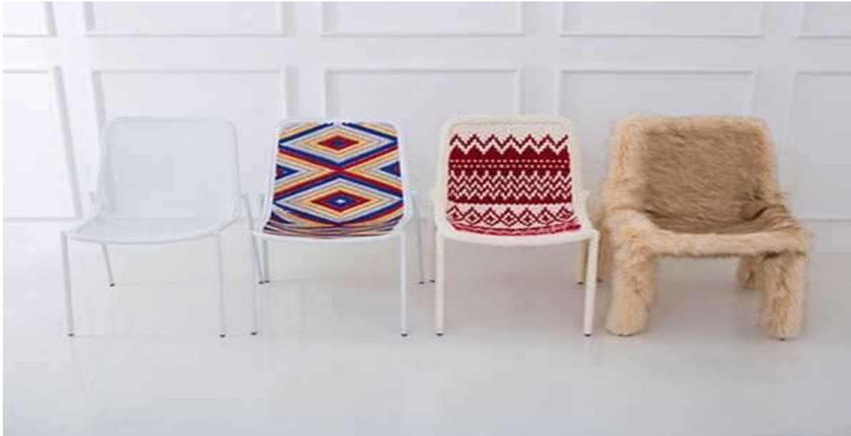
Figure 4 - Art styling chair with textile.

examples that are inspired by historical periods, where the characteristics of the style and techniques are minimized to interact with what is required nowadays.