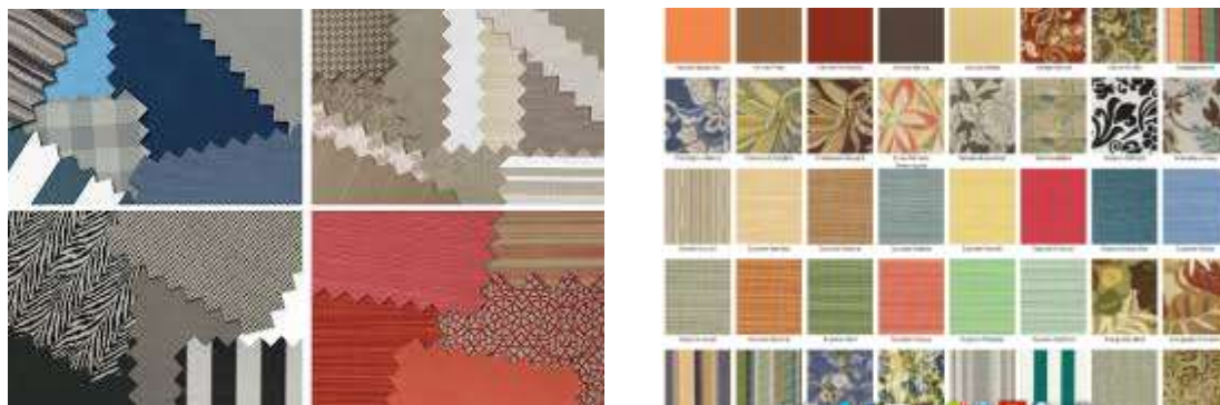
Fig. 2 Examples of fabrics for furniture

The possibility of combining color and design is unlimited so there is an advantage over other textile materials. Textile materials are missing air, moisture and heat transfer, they are resilient and have a tendency to return to the initial length after stretching. Negative trait is the little resistance to friction, difficult to clean and easy to dirty.