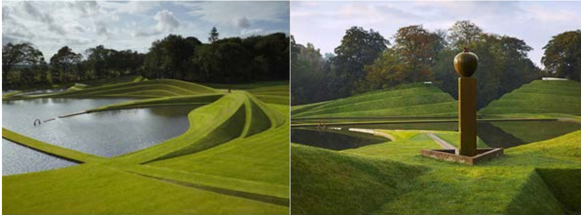
Figure 4. Very old Land art

Observers must follow the path of the artist, communicating with nature in the dimension that is beyond the usual experience; otherwise you will have to accept his world and unavailability to be content with drawings and photographs. But the artwork that exists, has not been seen bordering abstraction.