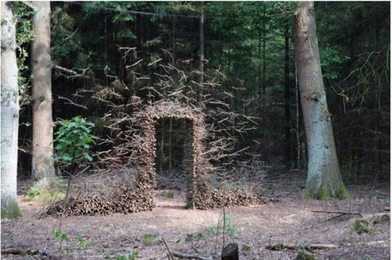
Figure 2. Artificial Land art (created by designer ie the artist)