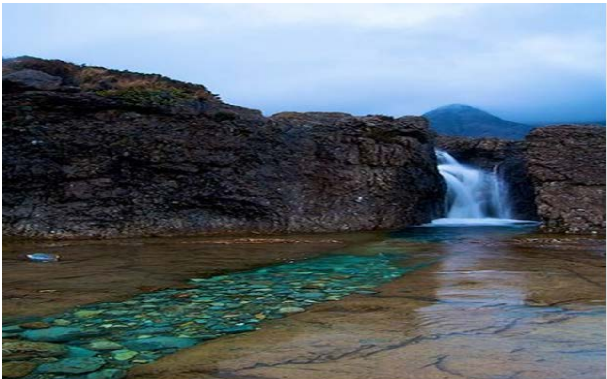
Figure 1. Natural Land art (where nature has done its own without inserting a man)

To create this specific form artist often use materials found in the environment where they build and ask themselves objects, the choice is often the elements that are sustainable and associated with the space hire. Topics are selected with a wide range, but usually processed headlines related to the history of a particular place, (re) animation space and lighting specific creative visions and ideas.