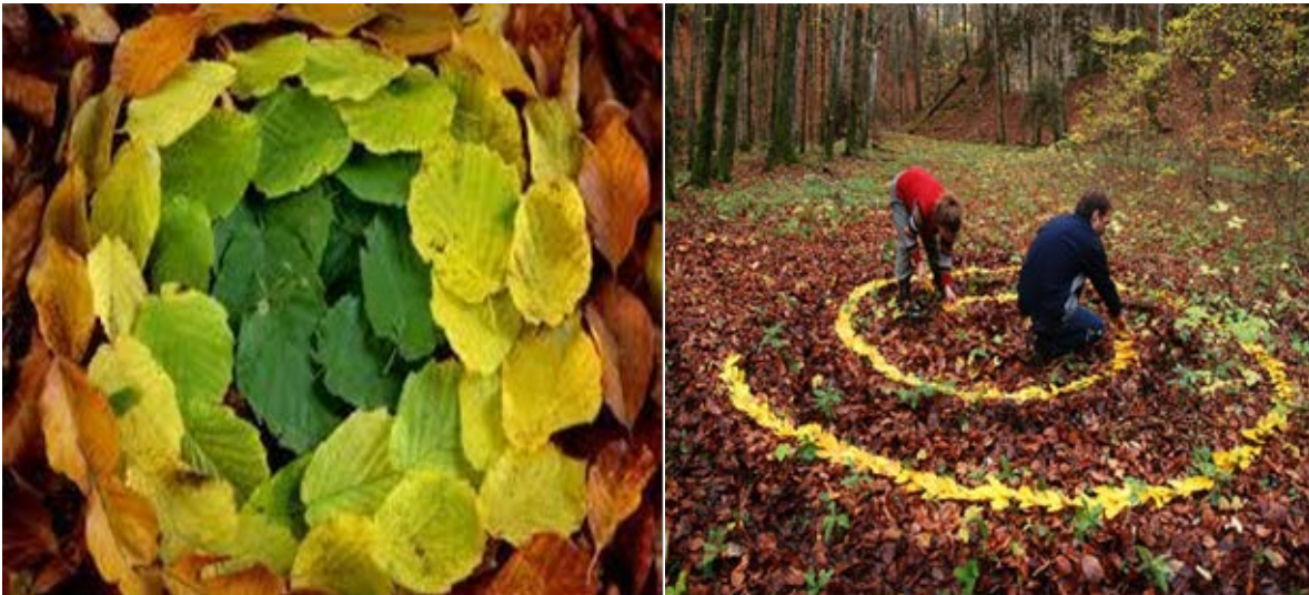
Figure 3. Time Land art