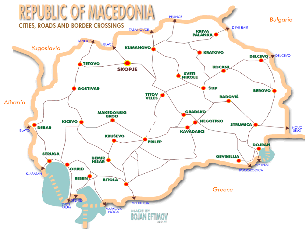
Figure 2. Map showing sampling points on the whole territory of the Republic of Macedonia