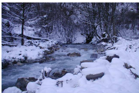
Figure 5. Appearance of Studenchica River at an altitude of 965 m