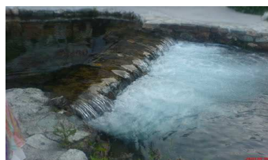
Figure 4. Appearance of whirlpool “Vrutok”

The analysis of variance at the 0.05 level of significance revealed that the population means for total As content didn't show significant difference only in the samples of potable water obtained from the water supply systems of Star Dojran and Gevgelija “Moin” ( p=0.691 ); Nov Dojran and Gevgelija “Moin” ( p=0.871 ); Star Dojran and Nov Dojran ( p=0.0695 ). This is due to the vicinity of drilled wells “Moin” to the foothills of Kozhuf Mountain, as well as, to the vicinity of the drilled wells in Dojran Municipality to the thermal- mineral area of Mala Boshka – Toplec. The analysis of variance at the 0.05 level of significance, also revealed significant difference in the populations means for the total As content in the samples of potable water obtained from the water supply system of Demir Kapija and Gradsko ( p=0.012 ). This is due to the fact that the Boshava River springs from the Kozhuf Mountain.