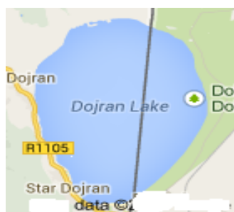
Figure 3. Map showing sampling points in Dojran municipality