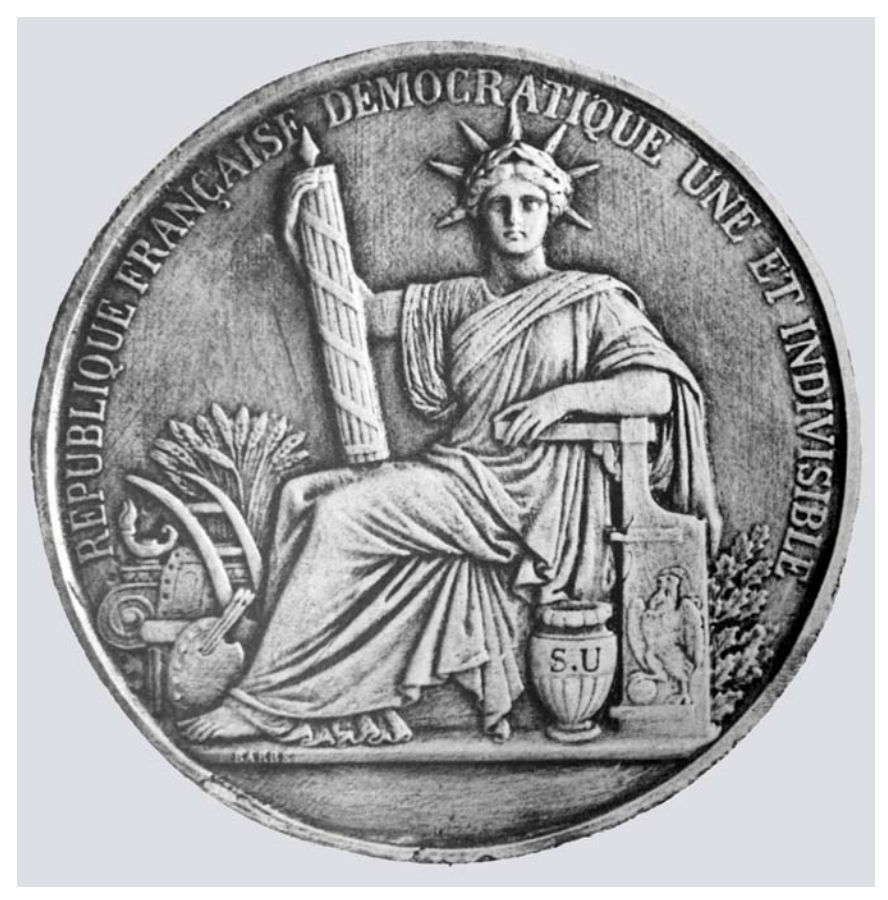
Fig. 8. Jean-Auguste Barre (1811–1896), Medal of the grand seal of the second French republic, November 24, 1848. Brass and resin. Archives nationales de France, Paris. After Agulhon 1981, p. 90.

How the second republic was to represent itself was a problem of enough importance for artistic competitions on the theme of La République to be arranged. Both a painter's competition and a competition for public monuments