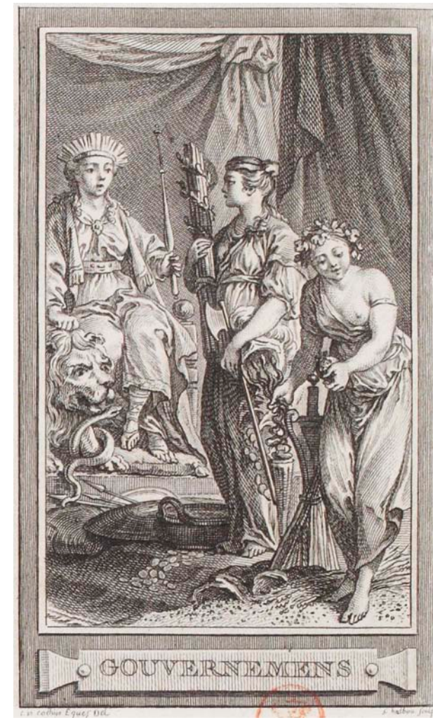
Fig. 2. C. N. Cochin (E. del.), "Gouvernemens", in Gravelot, Cochin & Gaucher, Iconologie ou traité de la science des allégories à l'usage des artistes (1791–1796).

Democracy has a plainer habitus; she is associated with fertility and the simple pleasures of commoners. Her head is adorned with wine leaves, she carries a pomegranate in her left hand, her left breast is revealed, and she stands barefooted directly on the soil with its harvested ears of corn (by contrast, Aristocracy stands on a carpet). According to the description, the bundle of four snakes which Democracy holds in her right hand supports the idea of Unity, "the basis of Democracy" ( "base de la Démocratie" ), together with the pomegranate and the wreath of wine leaves. These attributes are all "more proper civic substitutes for the crown" ( "il seroit mieux de substituer des couronnes civique" ). Behind Democracy is an odd arrangement described as a rudder supported with "a lot of sticks" ( "soutenu pour une grand nombre de baguettes" ); it apparently symbolizes how the government is elected with the support of