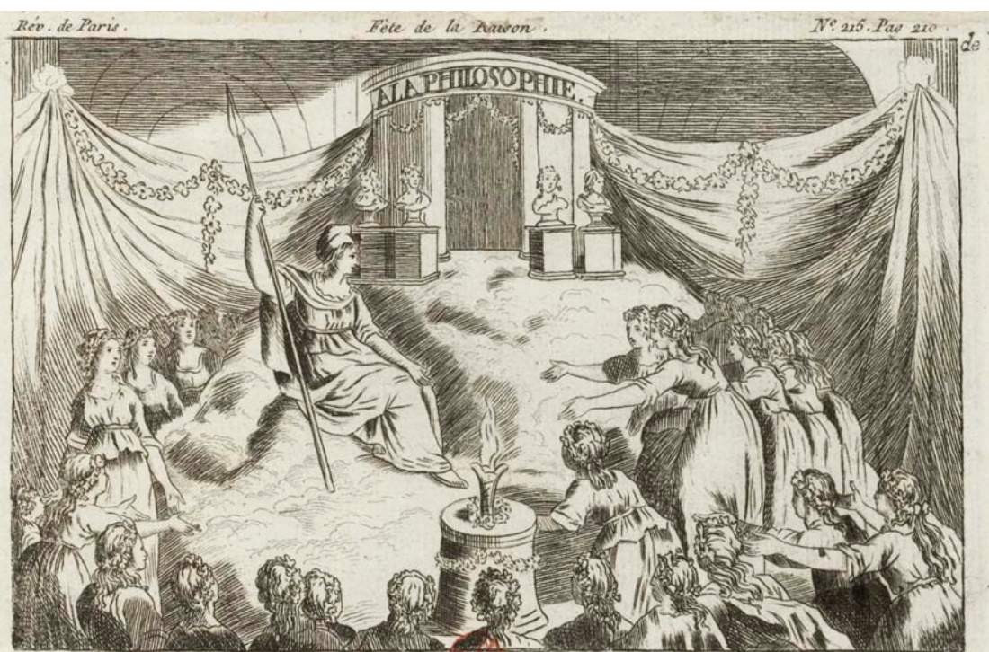
le Décadi 20 Brumaire de l'an 2ª de la Republique française une et indivisible. la Vete de la Raison a été Célébrée dans la Cidevant Église de Nobe Dame.

Fig. 5. "Le décadi 20e brumaire de l'an 2<sup>e</sup> de la République française une et indivisible, la Fête de la Raison a été célébrée dans la Cidevant Eglise de Notre Dame". (The tenth day of that week or the 20th Brumaire in year 2 of the French republic one and indivisible, the Festival of Reason which was celebrated in the former church of Notre Dame.) Révolutions de Paris, No 215, Nov. 1793, p. 210, ed. Louis-Marie Prudhomme. Paris, Bibliothèque national de France, Département des Estampes et de la Photographie (Gallica: https://gallica.bnf.fr).