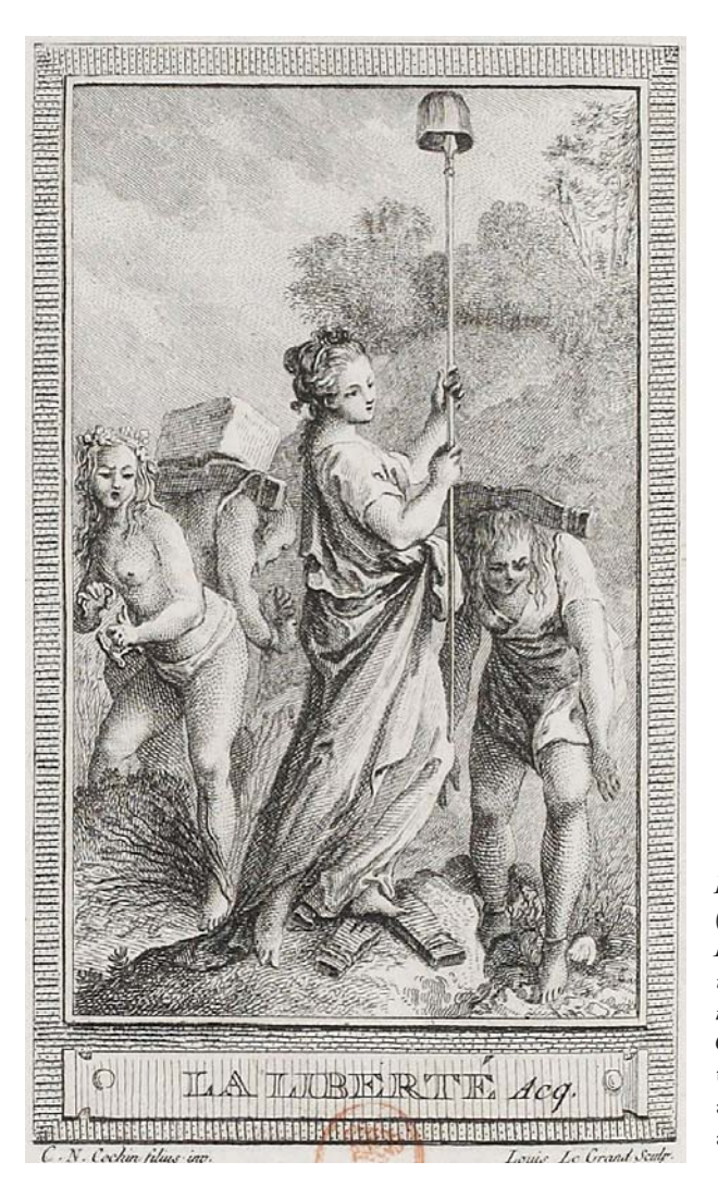
Fig. 4. C. N. Cochin (filius inv.), "La Liberté Acq" (Liberty won through valour), in Gravelot, Cochin & Gaucher, Iconologie ou traité de la science des allégories à l'usage des artistes (1791–1796).

tif refers to a ceremony in which slaves to be released were touched by a wand and given the pileus as a sign of their new freedom. However, the coins from the reign of Heliogabalus do not differ from the earlier ones. They show the traditional iconography, which was later repeated in various editions of Cesare Ripa's Iconologia – even though in the 1603 edition Libertà is holding a simplified cardinals' hat instead of the pileus .