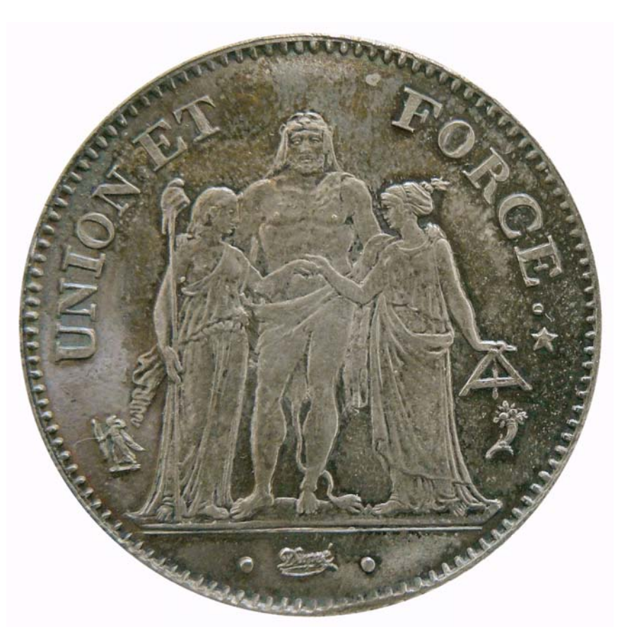
Fig. 7. Auguste (Augustin) Dupré (1748–1833), 5-franc silver coin of Year 5 (1796–1797). Musée carnavalet, Paris, Cabinet des médailles, aquisition number NM 1421.

In his study of the development of the "Marianne" theme, Agulhon compares and juxtaposes a wide range of examples of how artists continued to struggle with the representation of the Republic. Was she to be shown as an abstract entity removed from political dissent and class interests, or was she to be identi-