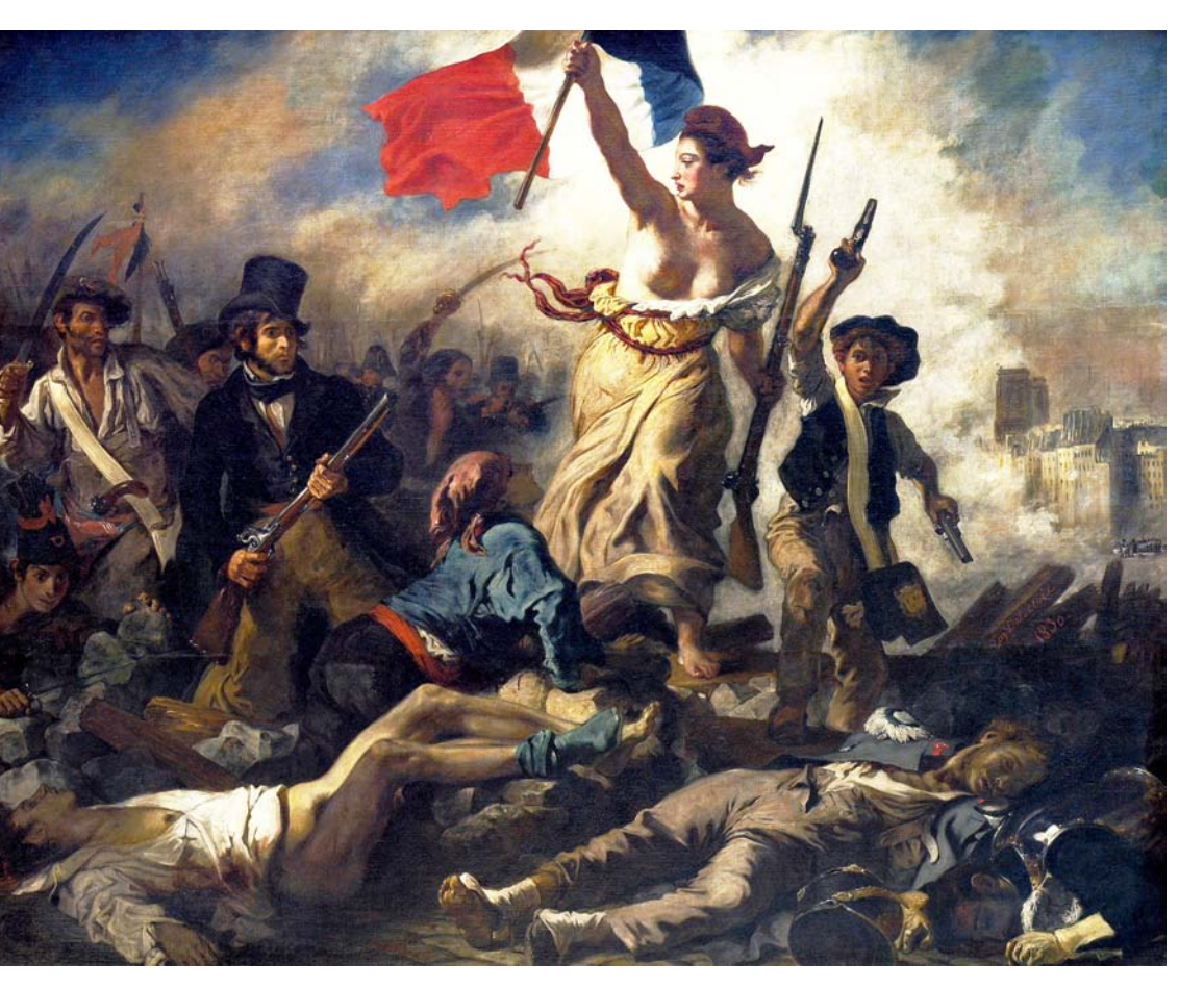
Fig. 1. Eugène Delacroix (1798–1863), La Liberté guidant le peuple, 1830. Oil on canvas, 260 x 325 cm. Musée du Louvre, Paris, acquisition number RF 129. Wikimedia commons (1st-art-gallery.com).