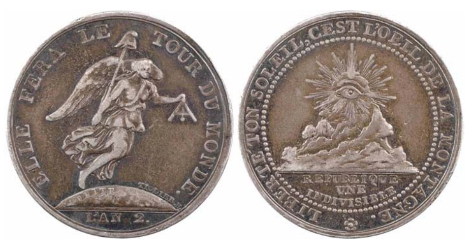
Fig. 6. Pierre-Joseph Tiolier (1763–1819), Silver version of medal issued in the Summer of Year 2 (1794), probably June, 30 (according to Hennin 1829). Cfr Hennin 1829, item no 630, plate 62.