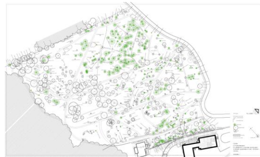
Fig. 2. Dendrological drawing of the object.

resolution satellite data, the results are useful in combination with traditional methods results, because the image provides additional information about the location and size of trees in the image objects delineated by the sketch. Anyhow some gaps in the drawing come into sight during the drawing amendment. To rectify these gaps, additional field work is needed, with an electronic telemeter.