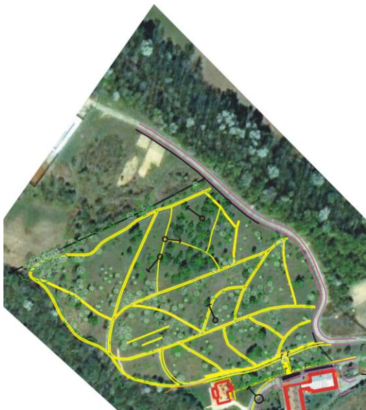
Fig. 1. Amendment of the drawing.

In comparison with traditional inventory methods the remote sensing data tend to produce better results representing vegetation cover. In the case of vegetation mapping using very high