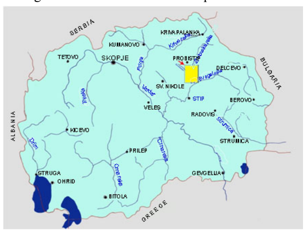
Figure 1. Map of Republic of Macedonia with the appointed position of the researching area

The area that was the subject of research comprises sediments from the immediate surroundings of the river Shtalkovska, Koritnica, river Kiselicka and River Zletovska to its estuary in the river Bregalnica (Figure 1). The field marked with a rectangle representing the area of the sediment samples.