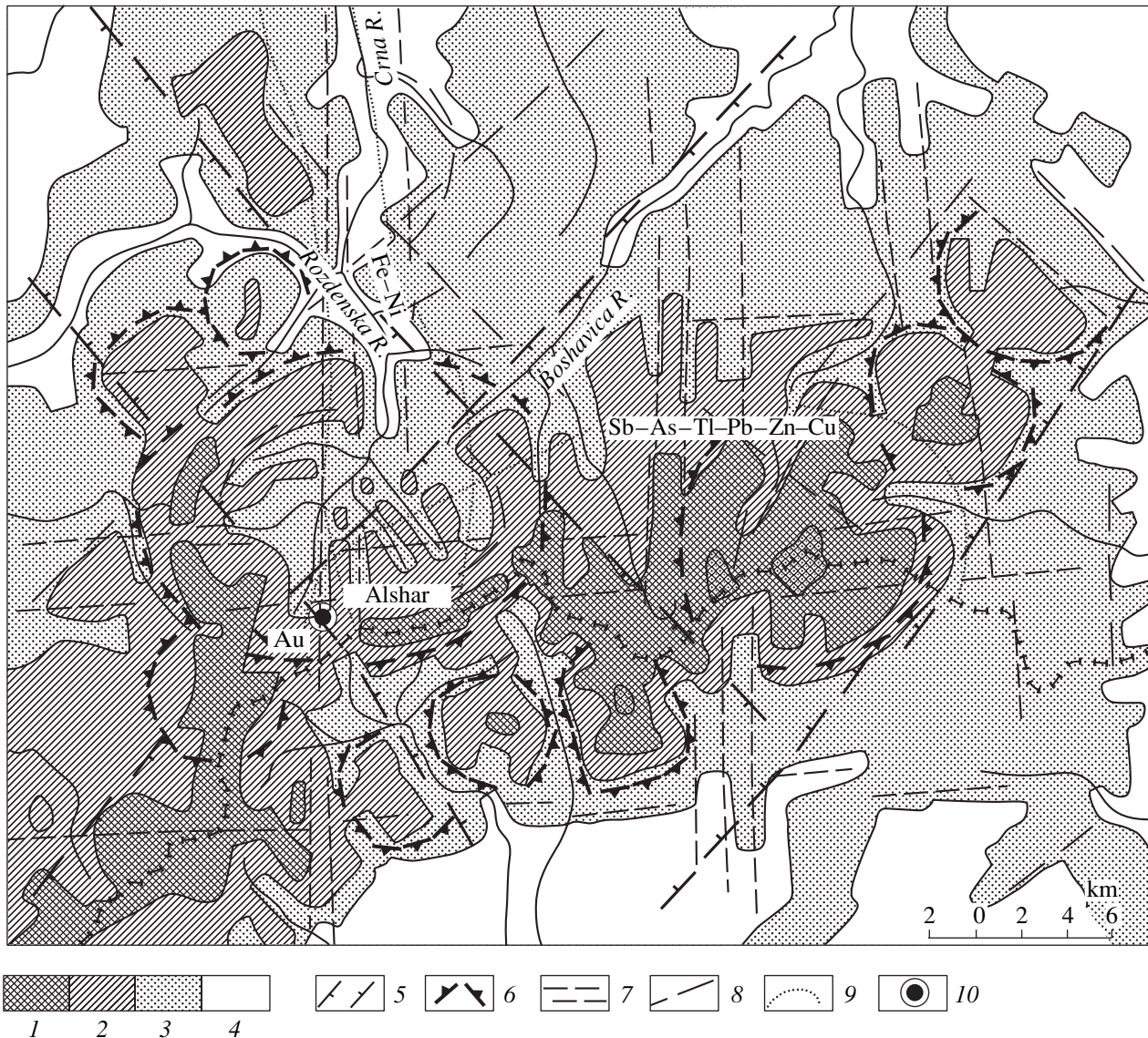
Fig. 2. Morphostructures of southern Macedonia. Hypsometric levels (m): (1) 1500–2000, (2) 1000–1500, (3) 500–1000, (4) below 500; (5) zones of diagonal dislocations; (6) boundaries of ring structures; (7) orthogonal deep-seated faults; (8) other faults; (9) geochemical halos; (10) Alshar deposit.

10 km across. In addition, one can also see a system of the younger NE-trending faults with related Pliocene volcanic flows. The Alshar ring structure is rimmed by a belt of subordinate domes no more than 5 km across along its periphery. Each of these structures can be comparable with the associated ore-hosting magma chambers (Fig. 2). Three subordinate domes located south of the Alshar structure in Greece have the most complex structure and contrast morphology. By analogy with other studied regions, such associated structures host large ore districts and deposits [5].