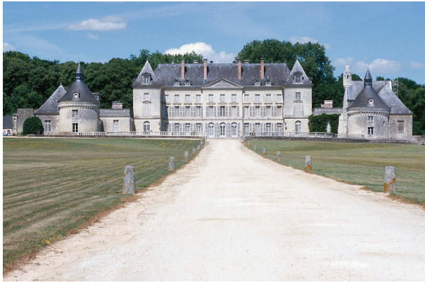
Fig. 3. Image 181.jpg