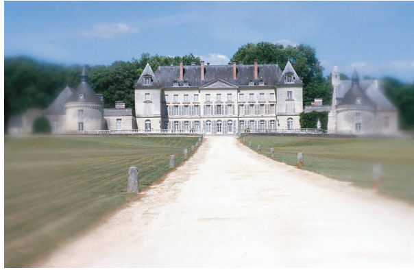
Fig. 4. Image 183.jpg

In the previous examples, the number of candidate images that QBIC gives for further processing is 10, and in part C and D that number is 20. These images are then processed by PWC.