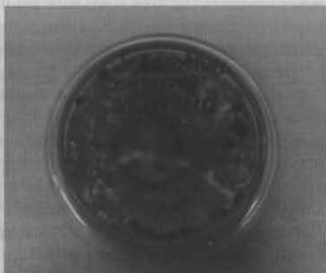
Figure 4: Sclerotia of S. sclerotiorum , isolate ss-1