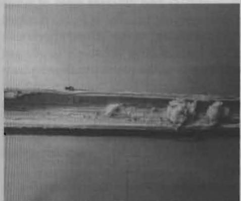
Figure 3: Sclerotia of S. minor inside the sunflower stem