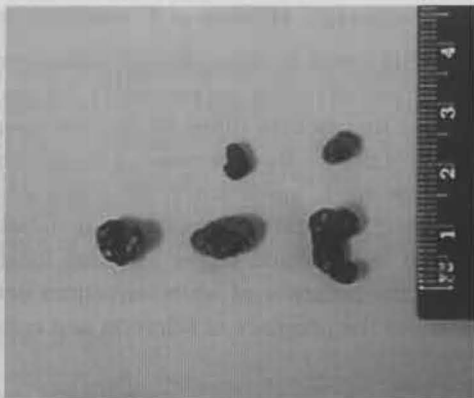
Figure 2: Sclerotia from S. sclerotiorum different in size and shape