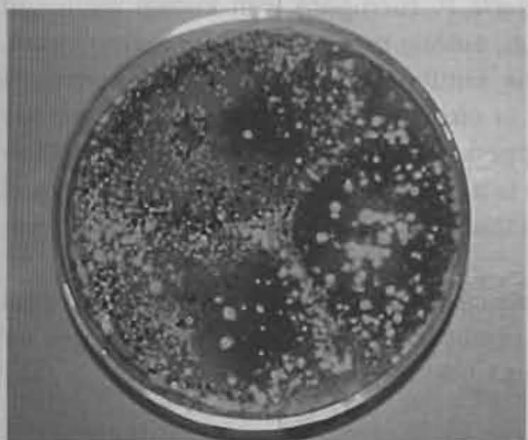
Figure 5: Sclerotia of S. minor , isolate sm-1