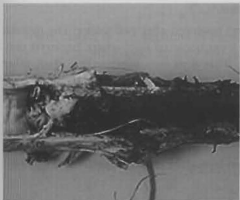
Figure 1: Symptom from S. sclerotiorum on the lower part of the stem and the presence of sclerotia