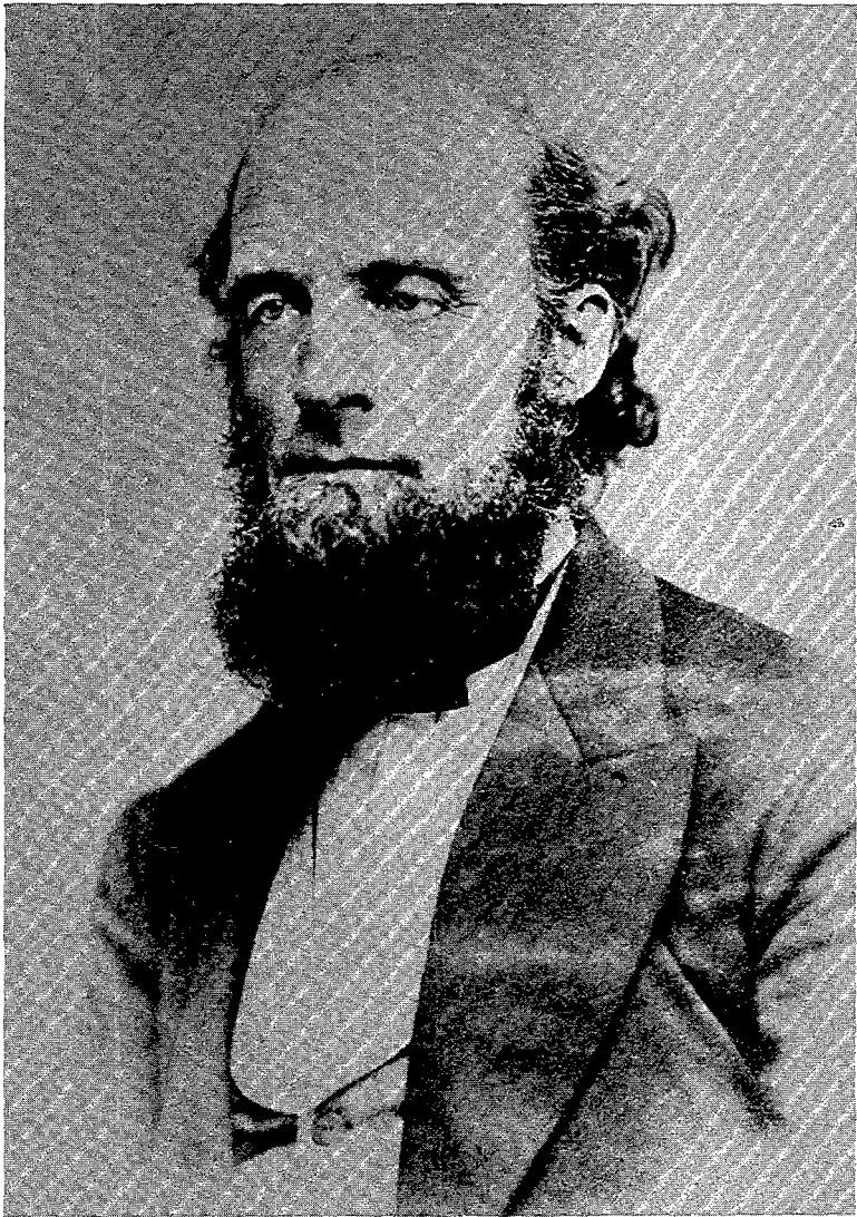
Governor Harrison Reed.