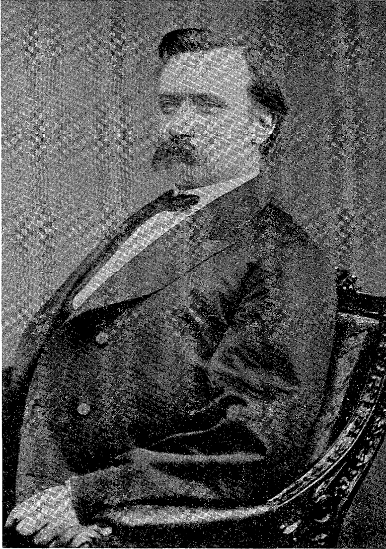
United States Senator Thomas Ward Osborn.