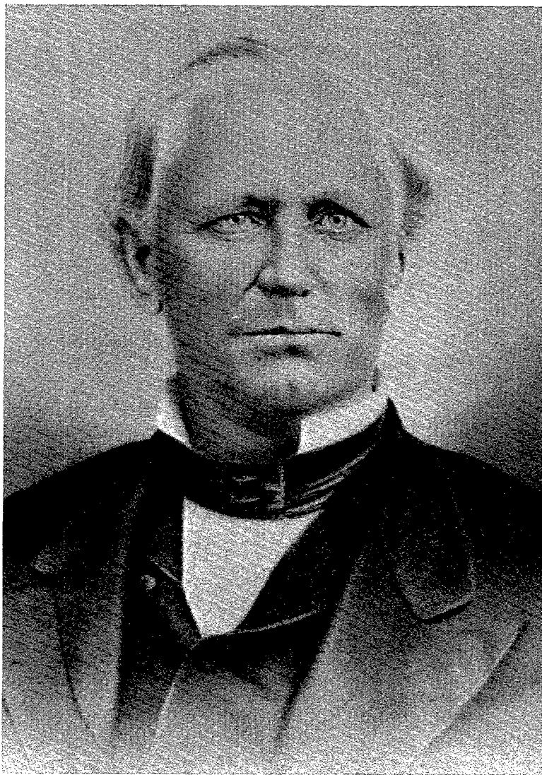
Governor Ossian Bingley Hart.