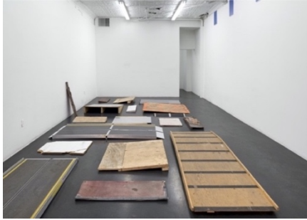
Figure 1 44