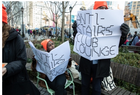
Figure 6 89

Emily Sara used the occasion of the Vessel's opening and Finnegan's protest to pen a broader critique of the "Art World's Ableism." 90 She presents her challenge as an "open letter" from "A Crip in the Arts." 91