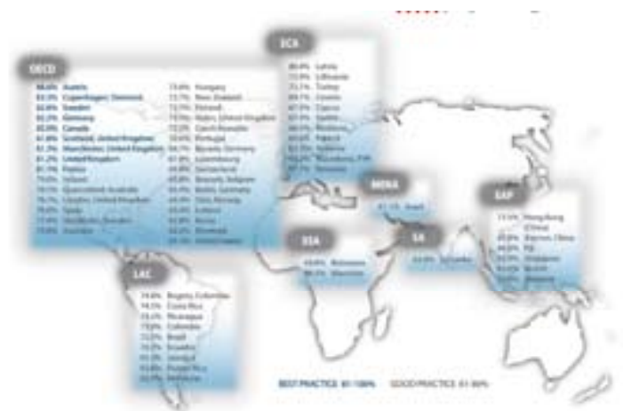
Best-Practice/Good-Practice IPAs by Region

GIPB 2009 is the second in a series of biennial surveys. In 2006, GIPB examined 96 IPAs. Those IPAs surveyed both in 2006 and in 2008 can track the evolution of their performance over time. This is, in fact, one of the main purposes behind GIPB; to allow IPAs to benchmark their performance and set milestones for improvement. The next survey will take place in 2010 (GIPB11).