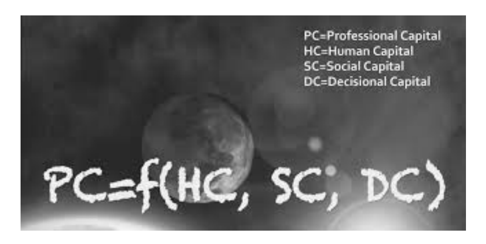
Figure 2: Formula for Professional Capital (Hargraves & Fullan, 2012, p. 88).

The organizations investment in the professional capital of the teachers has a significant impact on the success of educational reform or change efforts. Professional capital requires the organization to make a long-term investment in their teachers by providing them with continuous, high quality professional development, the resources to effectively implement the desired change or reform, promoting a culture of collaboration, and empowering teachers with the ability to make decisions to help individual students succeed (Hargraves & Fullan, 2012). When teachers feel invested within the reforms and initiatives, it leads to greater buy-in and success of the reform (Hargreaves & Fullan, 2012). In the present study, during the collection of the qualitative data through focus group and individual interviews, the researcher focused on the specific professional development and resources the teachers have received from the department, building, district and state level regarding the implementation of the New York State K-12 Framework for Social Studies and the additional professional development and resources they believed were necessary for the implementing the new framework successfully. During the coding of the qualitative data, the researcher focused on the recurring themes