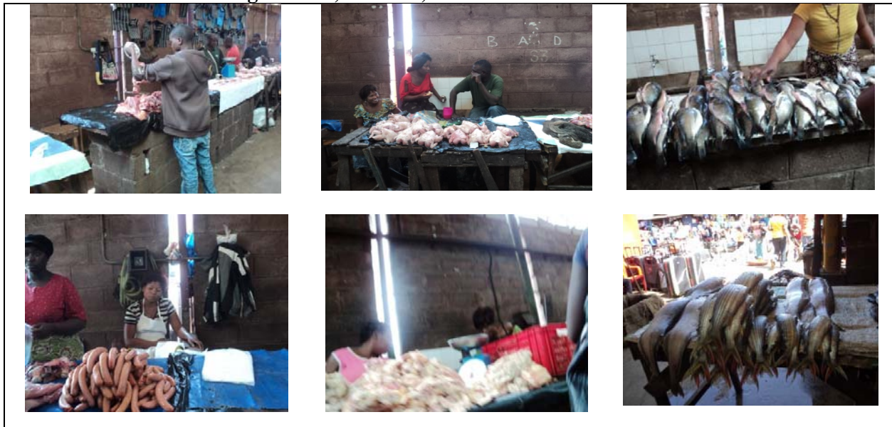
Plate 1. Informal Retailing of Meat, Chicken, and Fish in Lusaka