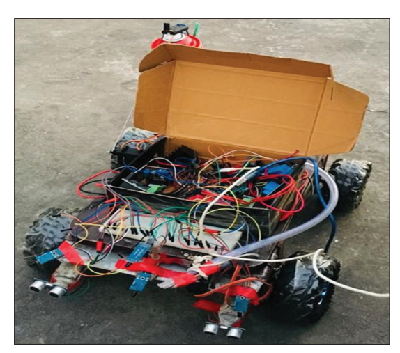
Figure 3: Structure of Autonomous part