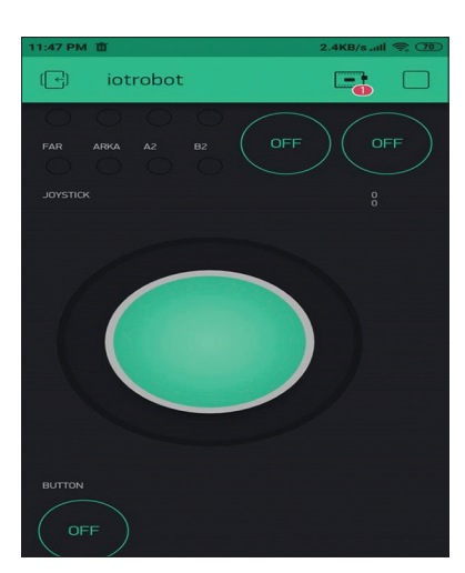
Figure 2: Shows the interface of the app