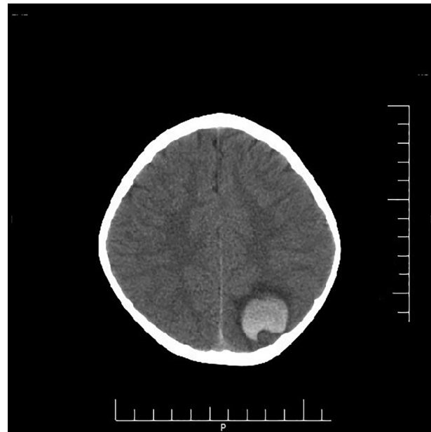
Figure 2. Axial non-contrast brain computed tomography scan showing intraparenchymal hemorrhage with mild peripheral vasogenic edema in the left parietal lobe

with abnormal findings in brain CT scans, the presence of coagulopathy concomitant with seizure would significantly increase the possibility of intracranial hemorrhage (P value = 0.049).