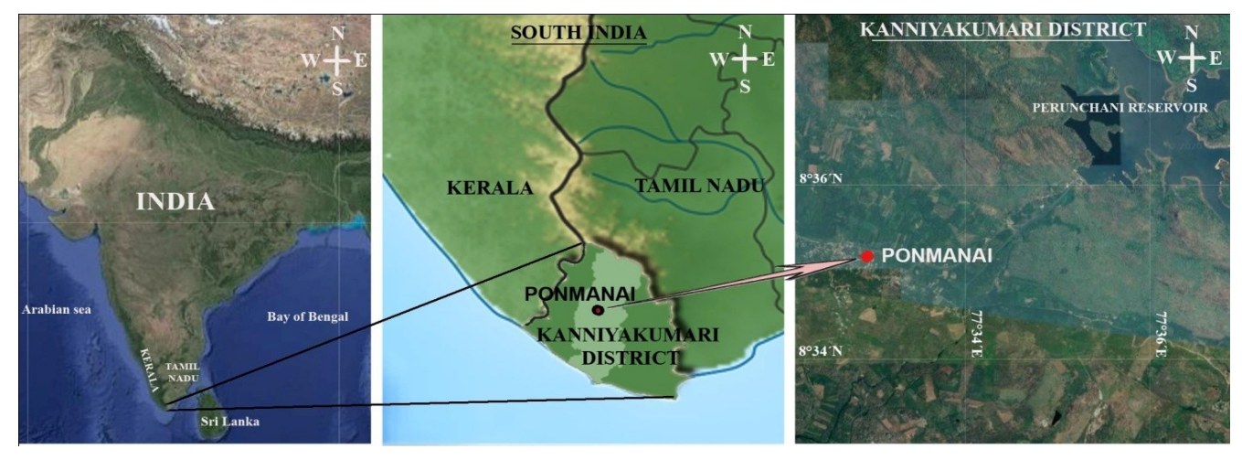
Fig. 3. Location-map of Fissidens axilliflorus Thwaites & Mitt. in India.

of thin-walled cells. Further differences between the two species are given in the key above.