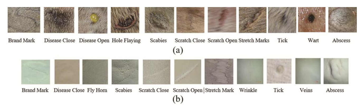
Fig. 1 — Samples of (a) Raw Hides and (b) Wet Blue Leather

which increases the performance of segmentation step. Secondly, segmentation task is accomplished with the aid of FCM through centroid optimization technique. The proposed Monarch Butterfly Optimization (MBO)<sup>9,10</sup> technique used to predict optimal centroid with fitness function as segmentation accuracy to get the segmented defective image<sup>11</sup> and obtained results are compared with the performance of Grey Wolf Optimization (GWO).