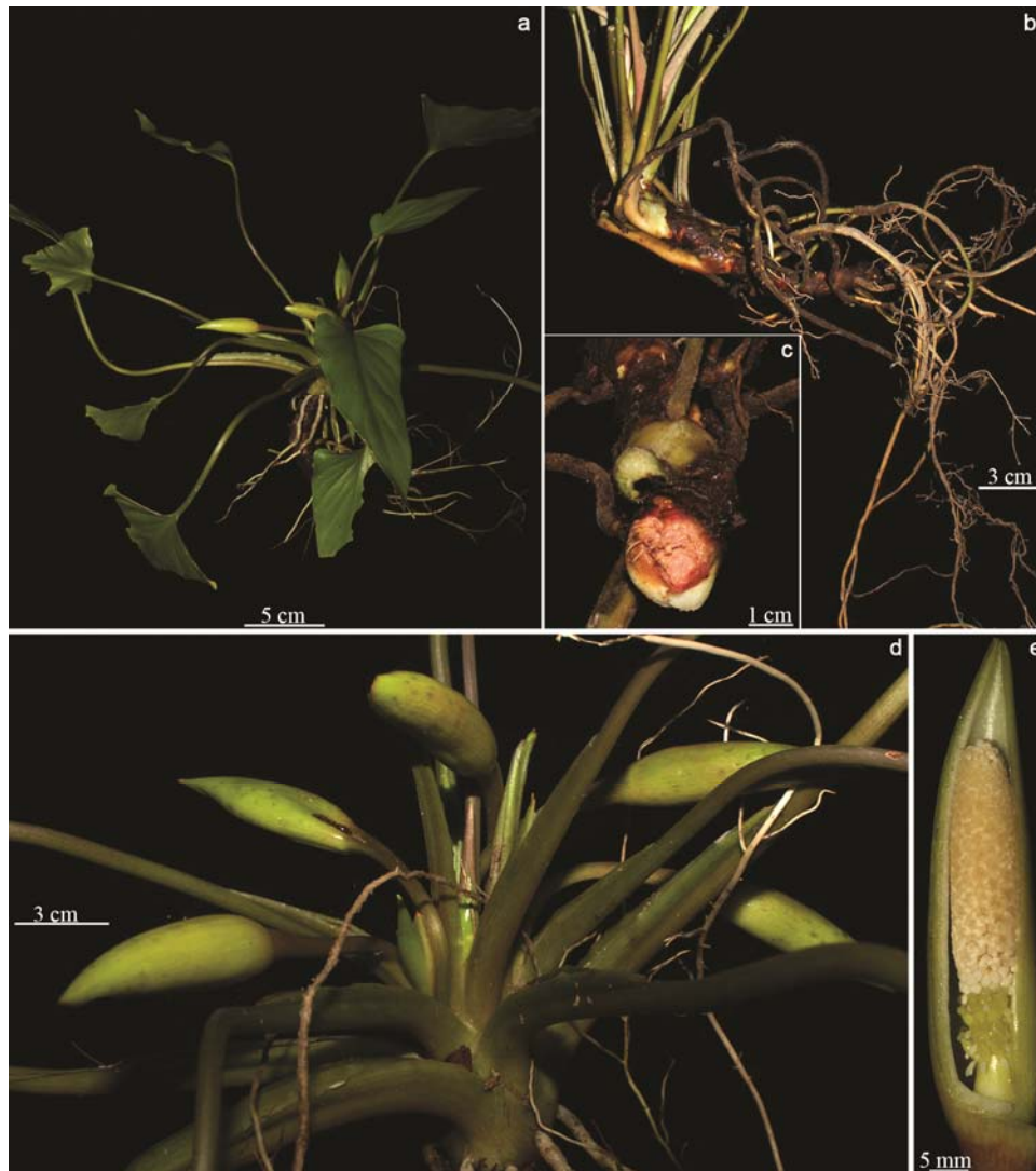
Plate 1 – Homalomena pierreana . a) Habitat and leaf blade b) Rhizome c) Cross section of rhizome d) Inflorescences and spathe e) Spadix.

Stem 8–14 cm long, 1.5–2.0 cm in diameter. Leaves 6–8; petiole 10–15 cm long, 0.4 cm in diameter, green-grey. Leaf blade 8–10 cm long, 3–5 cm wide, triangular or hastate, apex cuspidate, dark green adaxially, pale green abaxially, midrib impressed adaxially and prominent abaxially, lateral veins diverging from the midrib and then towards leaf margin. Inflorescences 2–5; peduncle much shorter than petiole, 4–5 cm long, 5 mm in diameter, grey to brown. Spathe longer than spadix, green at young, pale yellow at anthesis, elliptical, apex cuspidate. Spadix shorter than spathe, 2.5–3.0 cm long, conical, white-green; female part 8 mm long, cylindrical; ovaries bottle-shaped, 3-lobed, pale green, ca. 2 mm tall, ca. 1 mm in diameter, ovules hemianatropous, many; staminode white, subcylindrical to slightly clavate; style 0.5 mm long; stigma globose, 0.5 mm in