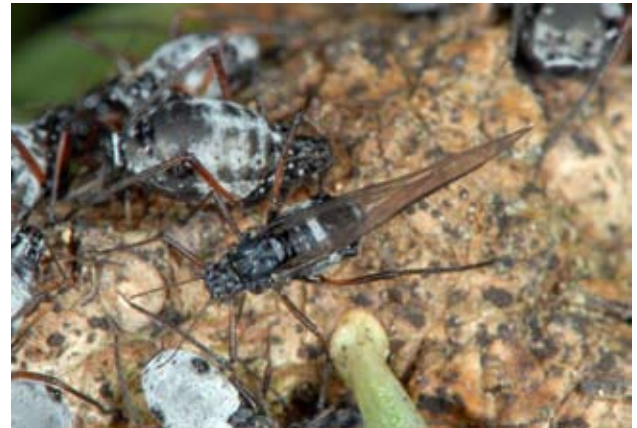
Fig. 7: The winged adult of C. curvipes

Slika 6: Nekrilata oviparna samica z različnima koničastima sifonoma, ki izlega ličinko