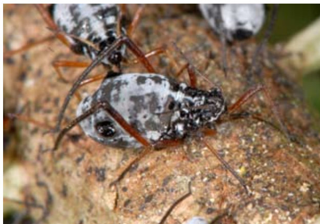
Fig. 8: The colour of the fore and middle legs is brown; the hind femora are brown with a darker distal part, parts of the abdomen are covered by a blue-whitish or pale grey wax powder

Slika 8: Barva sprednjih in srednjih nog je rjava, femur zadnjih nog je tudi rjav s temnejšimi distalnimi deli, deli abdomna so prekriti s svetlo modrim ali svetlo sivim voščenim poprhom