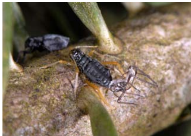
Fig. 9: The sloughing of C. curvipes larva; the picture taken in the laboratory on 12 th December 2007

The genus Cinara belongs to the subfamily Lachninae. The Lachninae comprises 365 species recorded globally, of which more than 200 species belong to the genus Cinara . About 150 species are native to North America, 38 in Europe and Mediterranean, and 20 in the Far East (HEIE 1995, BLACKMAN / EASTOP 2006). In Slovenia, 197 species from the family Aphididae have been recorded, the number of species in the subfamily Lachninae and genus Cinara in Slovenia is not known (MODIC / UREK 2008). There is no published work on the genus Cinara , but there are numerous reports on aphid honeydew producers in Slovene professional