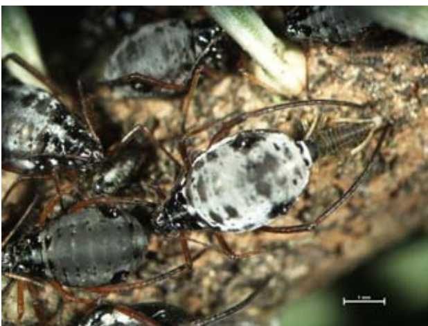
Fig. 6: Apterous oviparous female with distinctive conical siphae, delivering larva

Slika 5: Lokacije najdišč vrste C. curvipes