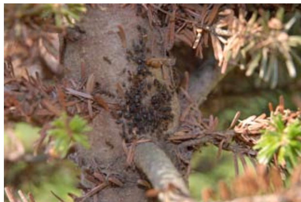
Fig. 2: Thin stem of Abies alba "Brinar" with the colony of C. curvipes

The third population of bow-legged fir aphid was found 3 km from the second location, on a tree of A. concolor in the park of the firm Drevesnica Omorika, near Muta on 12 th December 2007 (Lat.= 46°35'55.18", Long.= 15° 9'9.68", 374 m a.s.l.). The tree was about 40 years old; its height was 15 m, DBH 18 cm. The aphids formed colonies on two lower branches, the individuals inhabiting the underside of branches of their food trees. The first colony included ca. 280 adults and the second 360 adults, with numerous instars. About 5%