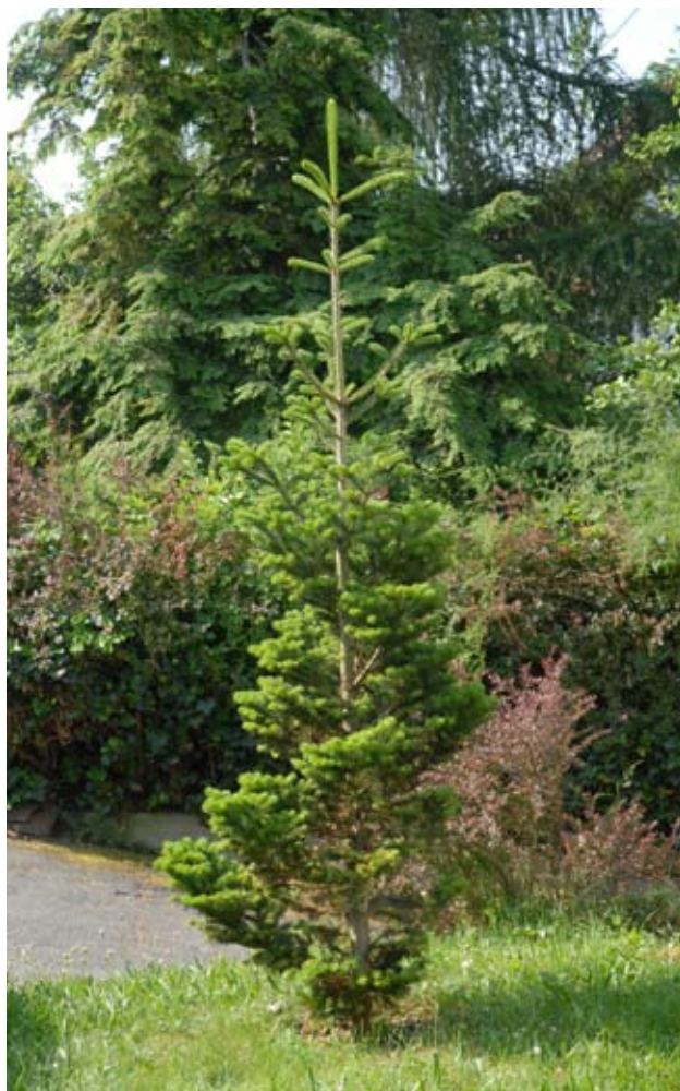
Fig. 1: Silver fir ( Abies alba "Brinar") attacked by C. curvipes in Ljubljana, 26 th May 2007

Slika 1: Navadna jelka ( Abies alba "Brinar", ki jo je napadla vrsta C. curvipes v Ljubljani, 26. maj 2007