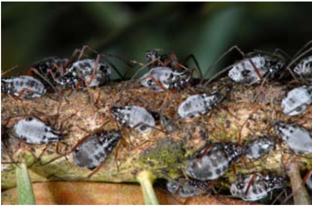
Fig. 4: Branch of A. concolor from underside attacked by aphids C. curvipes , 12 th December 2007

Slika 4: Veja dolgoigličaste jelke ( A. concolor ), na spodnji strani napadena z ušmi vrste C. curvipes , 12. december 2007