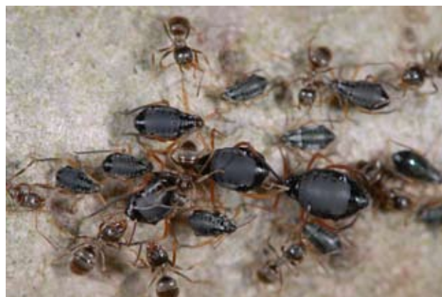
Fig. 3: C. curvipes , detail of dense feeding colony protected by ants on A. alba "Brinar"

Slika 2: Debelce vrste Abies alba "Brinar" s kolonijo uši C. curvipes