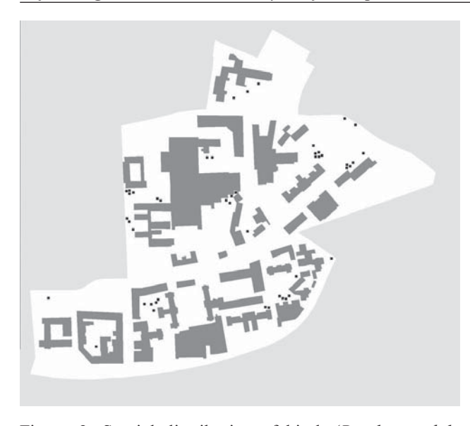
Figure 2: Spatial distribution of birch ( Betula pendula Roth.) (black) in the vicinity of hospital buildings (grey) Slika 2: Prostorska razporeditev brez (Betula pendula Roth.) (črno) v bližini bolnišničnih stavb (sivo)

Table 4: Distance from each birch to the nearest hospital building (in meters)