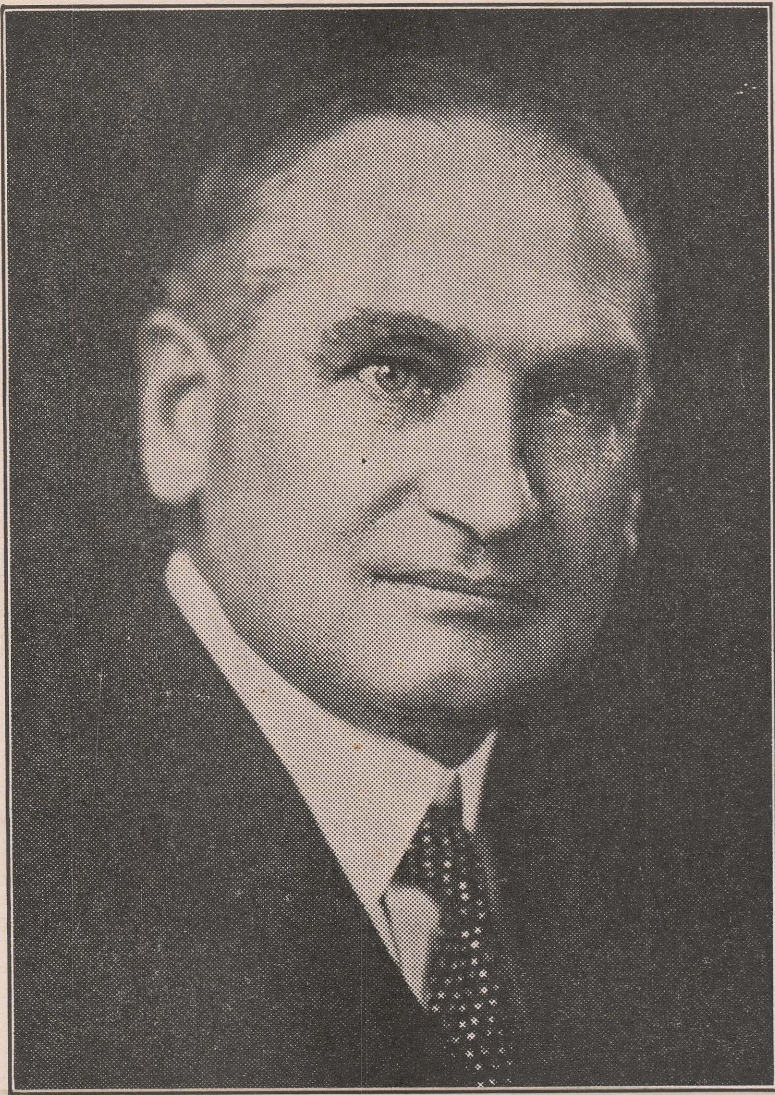
WILLIAM LANGER United States Senator