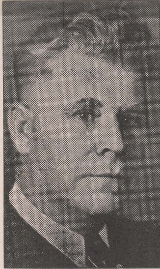
JACK PATTERSON Lieutenant Governor