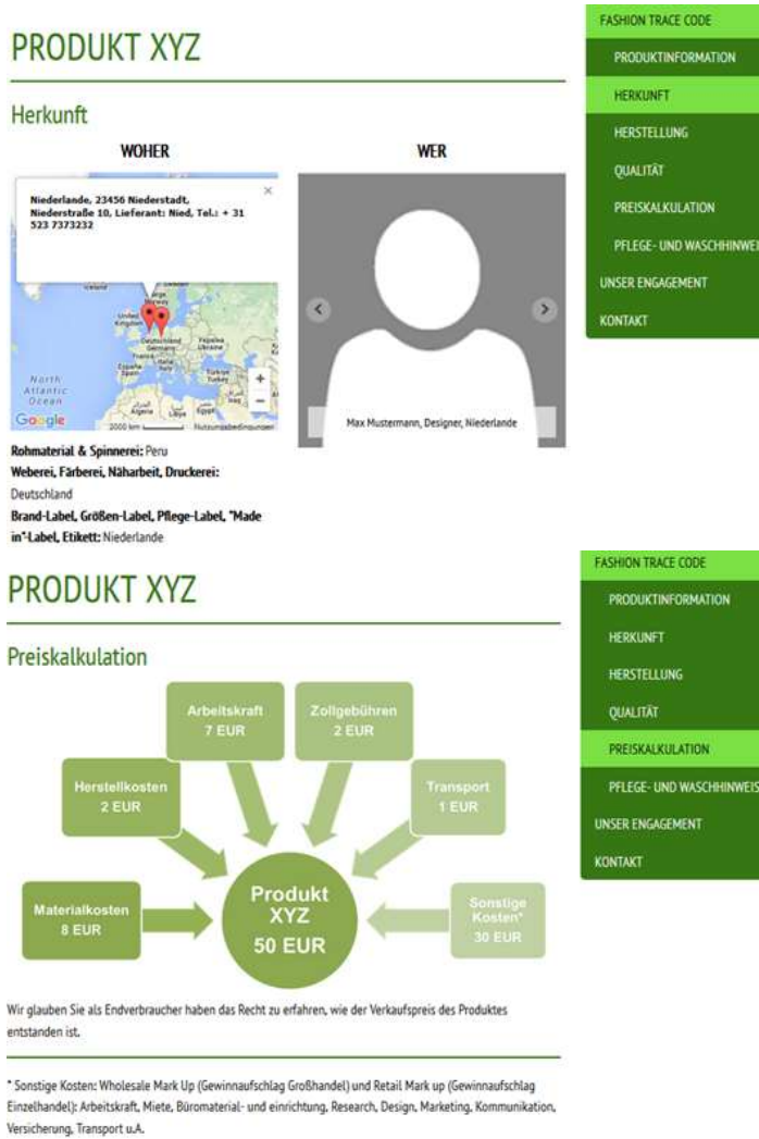
Figure 3: Example place of origin and price calculation from the dummy fashion trace app