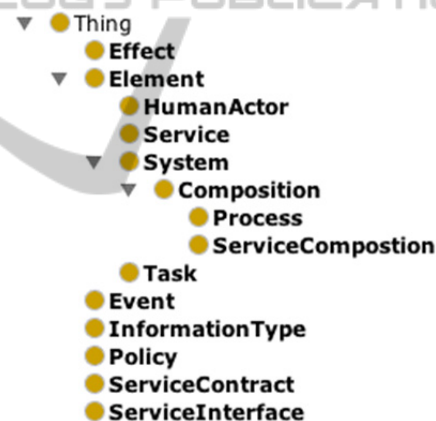
Figure 1: The Open Group SOA Ontology class hierarchy.

The starting point for our SOA Evolution Ontology is the Open Group SOA Ontology (Open Group, 2010). This was developed in order to facilitate understanding of SOA applications and improve communications between business and information technology experts. The Open Group SOA Ontology seemed an appropriate point of departure given its earlier use with ESARC and the maintainer's need to comprehend the system at multiple levels. The Open Group SOA Ontology is defined in the web ontology language (OWL) and is ready for extension and population for specific applications. In the ontology, 15 classes and 30 object properties are defined. The class hierarchy is shown in Figure 1.