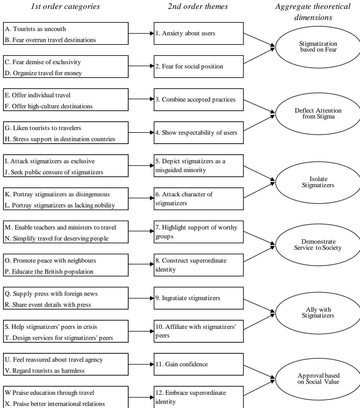
Figure 1: Data Structure