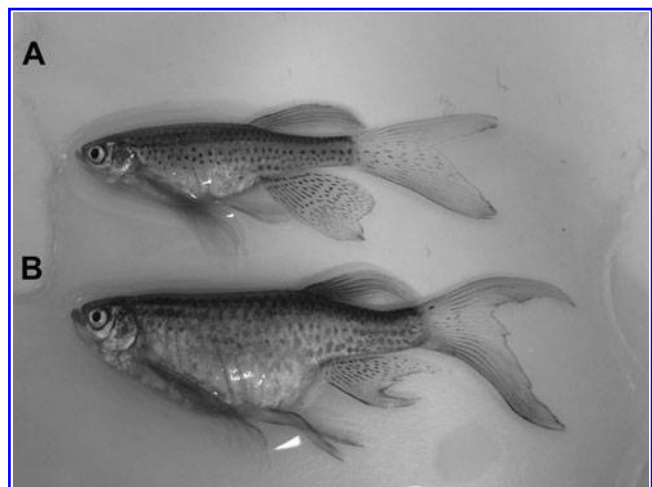
FIG. 1. Example of a descriptive annotation of a zebrafish welfare concern. (A) Normal appearance of zebrafish, (B) female with enlarged abdomen, which would be annotated as abdomen_general_distended .