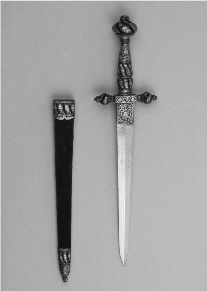
Figure 3. Damascened and blued dagger with velvet scabbard. Italy, ca. 1550. Wallace Collection, A817.

North was similarly discerning in choosing, decorating, and maintaining the weapons that went with these garments. Before departing for the Continent, he paid six shillings for a gauntlet and five shillings “for russetinge my rapier and my dagger with the girdel and hangers.” 144 At Antwerp, he bought “ij paire of knifes, w[ith] velvet shethes, and silver hafts.” 145 His tastes in fencing equipment tended toward the lavish and the