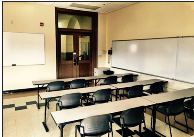
Figure 2. Traditional Classrooms

such arrangements, and inherent encouragement of student and instructor interaction (Herman Miller, 2008), the framework of social learning is a representative framework. In addition, the design promotes problem solving, collaboration, and teamwork through organization of space in spatial arrangements instead of in rows (Herman Miller, 2008), all components that are considered vital in constructing learning in a social setting. Vygotsky (1978) himself stated that “The basic characteristic of human behavior in general is that humans personally influence their relations with the environment and through that environment personally change their behavior, subjugating it to their control” (p. 51). Additionally, Coates (2005) has supported the framework of Vygotsky’s work in higher education, stating that the student engagement is foundational to the assumption of constructivism and the influence of individuals co-constructing knowledge together in activities that are purposeful, active, and collaborative.