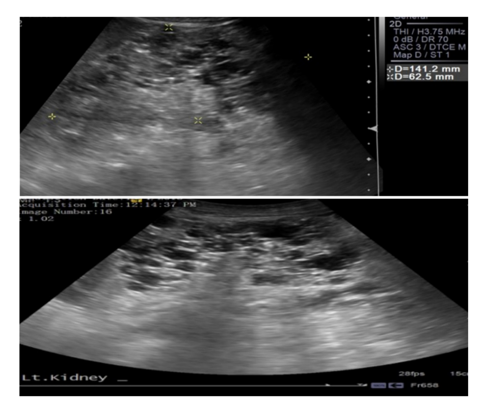
Figure 3: Ultrasound imaging reveals that both kidneys are enlarged with multiple cysts and loss of normal architecture, suggestive of polycystic kidney disease.

round nuclei and areas of degenerative cytologic atypia. These features can result in patches of tumor cells with large nuclei, irregular nuclear contours, and smudged chromatin (12). They are usually unilateral and single amongst the general population but can present as multiple and bilateral in patients with TSC (77). While the significance of renal lesions in TSC is firmly established, little is known about predictable biomarkers. Renal oncocytomas are a more common cause of renal cell neoplasms in patients with TSC than in the general population (78). The diagnosis of renal oncocytoma should be confirmed by immunohistochemistry to avoid differential diagnosis with epithelioid AMLs.