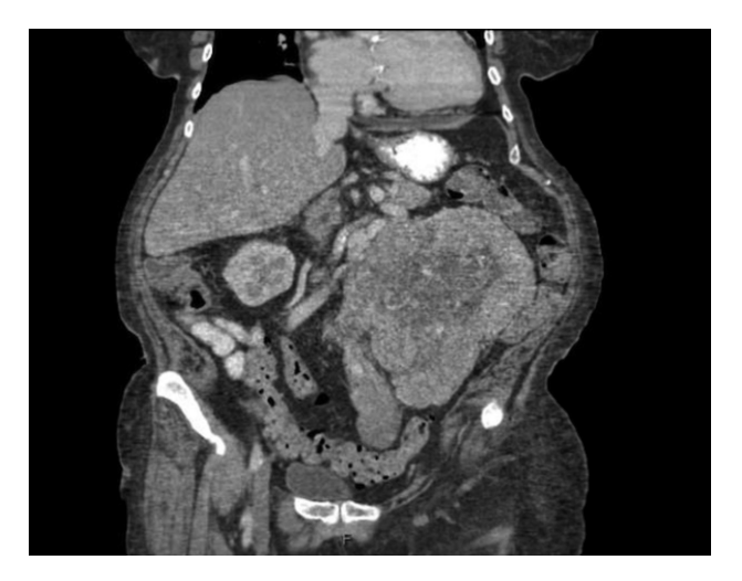
Figure 1: Coronal view of computed tomography of abdomen/pelvis revealing a large left renal mass with direct extension into the left gonadal vein.

The patient's medical and surgical history was unremarkable except for insulin independent diabetes mellitus. A left-sided abdominal mass was palpable on physical exam. Further evaluation revealed no evidence of distant metastatic disease on CT imaging of the head, chest x-ray, recent CT chest, or CT abdomen and pelvis. Magnetic resonance imaging of the abdomen, obtained approximately 1 month prior to her surgery, did not reveal any evidence of left renal vein involvement. After extensive counseling and a thorough discussion of the risks involved and the benefits, she opted for surgical extirpation of her locally advanced renal mass and regional lymphadenopathy. She underwent an open left radical nephrectomy, total abdominal hysterectomy with bilateral salpingo-oophorectomy, and retroperitoneal and pelvic lymph node dissection. Intraoperatively, the mass was found to be large and bulky, extending toward the pelvis and invading the local structures. The ascending colon was reflected medially, at which time the mass was noted to be involving part of the mesentery, which required resection. Once the hilum was controlled, the mass was dissected down toward