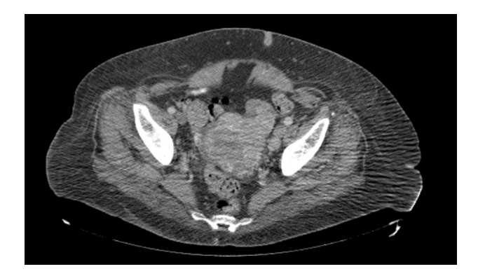
Figure 2: Axial view of computed tomography of the abdomen and the pelvis revealing a heterogeneous appearance of the uterus.

The left kidney, supracervical uterus, bilateral fallopian tubes, and ovaries were sent for histopathological examination. The left kidney measuring 21.0 cm in greatest dimension showed a 15.6 \times 11.2 \times 11.1 cm yellow, gelatinous, hemorrhagic, and necrotic mass that obliterated the lower pole. The mass invaded the perinephric fat abutting Gerota's fascia, the hilar fat, calyces, and distorted the renal sinus (Figure 3). The proximal renal vein contained tumor, which