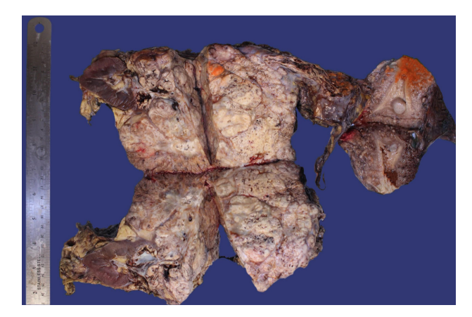
Figure 3: Gross examination of the surgical specimen revealed a large necrotic left renal mass extending via the gonadal vein to the uterus and bilateral ovaries.

obliterated its lumen up to the point of branching with the left ovarian vein, and then tumor thrombus obliterated the left ovarian vein while the stump of the ovarian vein was patent. Grossly, the uterus showed approximately 70% of the endomyometrium involved by the tumor and necrosis, with diffuse tan-white nodularity on the serosal surface (Figure 3). The endometrium showed a striated and irregular appearance. Sectioning of the left fallopian tube showed edema, a pinpoint lumen, and tumor invasion. The left ovary showed invasion of the mass, with the remaining ovarian parenchyma estimated at 20%. The right fallopian tube was filled with a sanguinous fluid without clear evidence of gross tumor involvement, but the right ovary showed invasion by the mass. The uterus was also noted to contain leiomyoma and a microscopic focus of complex hyperplasia with atypia. Congo red stain was negative for amyloid.