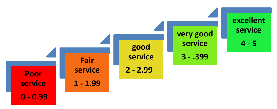
Figure 2Ranking of services

The respondents were asked to rate their opinions on the level of services quality provided by the service providers in the targeted sites. They could select from a list of items which were measured on a five-point Likert scale, with (with "5" indicating "very satisfied" and "1" indicating "very dissatisfied). Table 2 shows the ranking of the level of services evaluated by the three groups, (Customers, Business Owners, and Mastery Shoppers) The results revealed that, "the ooverall satisfaction by customers about the level of services evaluated as good service with mean at 2.46, while the lowest overall satisfaction was by the business owners when they evaluated their level of services against the indicators they have given and they supposed to be at mean 1.71 which indicated fair level of service, followed by the evaluation by the mystery shoppers with mean at 1.81. The lowest satisfaction (mean 1.54) which represents the opinion of mastery shoppers with the customer services Table2.