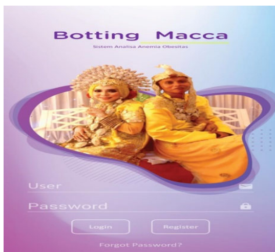
Figure 1: Login Features Menu

The Botting Macca application has some menus in it. The users would find a login menu consisting of a user and a password as the initial screen shown in Figure 1. After logging in, the user would get several advanced features, such as profiles, instructions for use, early detection features, results of early detection, and educational monitoring adjusted from early detection results. Users also can see a logout menu if they want to exit the application at any time. All of these features are shown in Figure 2. Figure 3 describes the items of early detection from the early detection feature, recommendation, and education that the application suggests to users.