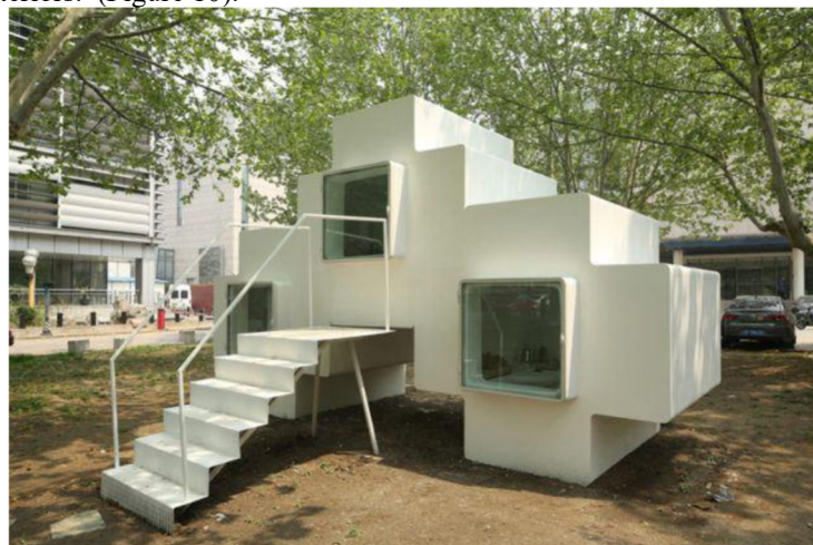
Figure 10 :Micro House, Studio Lui Lubin, China, 2013.

The micro house by Studio Lui Lubin team was designed considering the minimum area needed by people to sit, stand and lie in the interiors. (Figure 10).