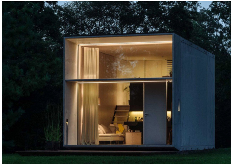
Figure 14 : KODA, Kodasema Architecture, Estonia, 2016.

What makes KODA special is that it has smart house technology. This way, as a house finding out about and adapting to its surrounding environment, it is a quite sustainable and environment-friendly design. Fronts are made of light concrete blocks specially designed for KODA. The living space front is all along glass. This opening helps it tone down the coldness of grey concrete of exterior with the colors and lighting of the interiors.