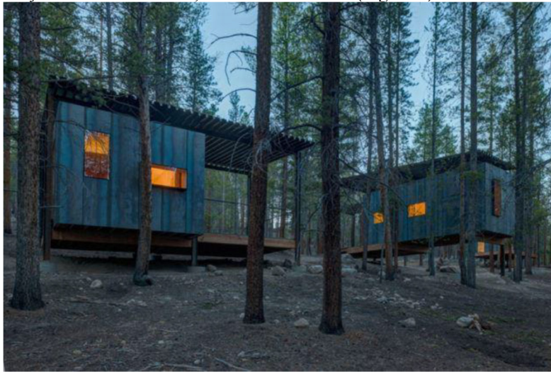
Figure 1: Dormitory, University of Colorado Denver, USA, 2015.

In this research first ‘Colorado Outward Bound Micro Cabin’, which are micro dormitories designed and developed by University of Colorado Denver, in the United States (Figure 1) was examined.