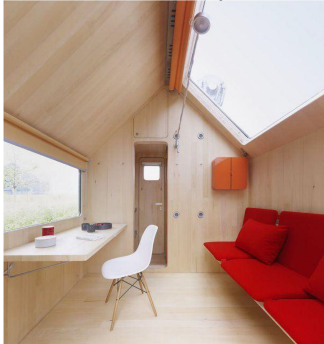
Figure 9 :Diogene, Renzo Piano, Vitra Campus Germany, 2013.

The architect used a simple language in interiors. The floors are coated with wooden floorings. He made interiors look spacious with the shade of the wood he selected. (Figure 9)