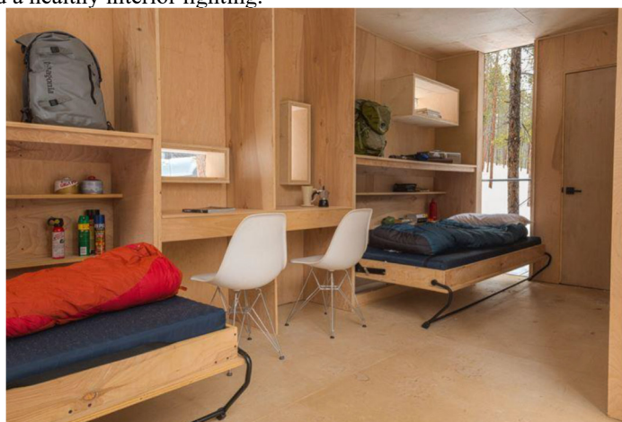
Figure 2 : Dormitory, University of Colorado Denver, USA, 2015.

The designers’ team had a lean and clear approach of interior architecture. The construct was designed to perform any function. Besides the naturality of materials, the color and shade of wood were carefully selected with the meticulous details of solutions in material joints. (Figure 2 and 3) The architectural simplicity and minimum use of windows ensured a healthy interior lighting.