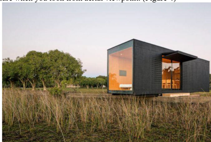
Figure 4 : MINIMOD micro house, MAPA, Brazil, 2013.

Green vegetation was used on the roof, which makes it gain such a seat within the nature that it is not possible to distinguish it from nature when you look from aerial viewpoint. (Figure 4)