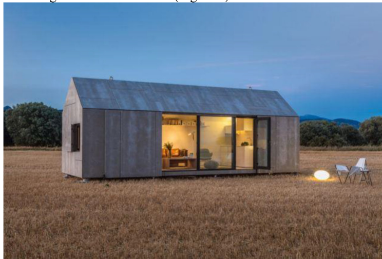
Figure 6 : Portable House APH80, Abaton Arquitectura, Spain, 2013.

At the design stage, architects defined and built the contours of the building without designing the interior; instead, they adopted a method of design from the inside out (Figure 6).