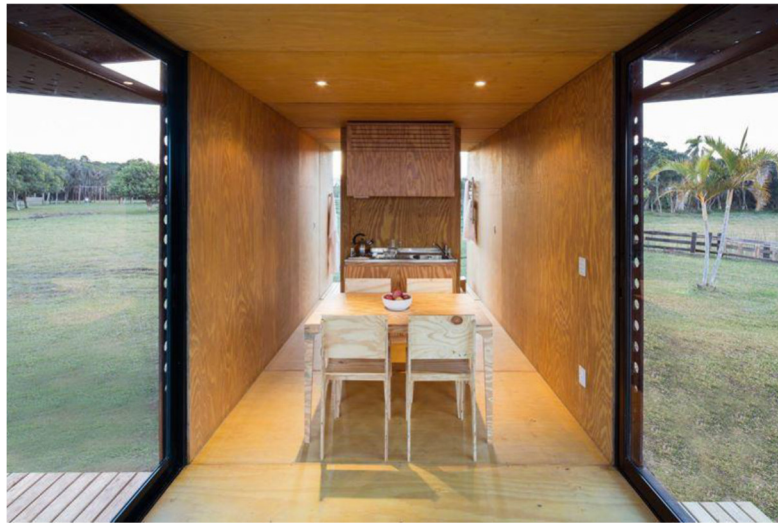
Figure 5 : MINIMOD micro house, MAPA, Brazil, 2013. 73

For the interior architecture of the building, there is only one wall which is for partition. The wall also provides passage between spaces on its right and left. The style of building ensures flow from a space to another. (Figure 5)