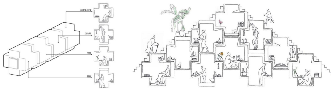
Figure 11-12 : Micro House, Studio Liu Lubin, China, 2013.

The building is mainly built with fiber-reinforced foam composite. This material renders it very lightweight. The dimensions of the building allow it to be fit in a container for transportability.