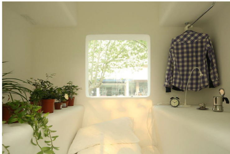
Figure 13 : Micro House, StudioLiuLubin, China, 2013.

The minimalist influence on the architecture of the building and the designers' team's approach to materials can also be seen in the interior. The user can easily meet their needs in the living space. White color and yellow light was preferred in the interior. The modular and multifunctional furniture were designed uniquely for this micro house. (Figure 13)