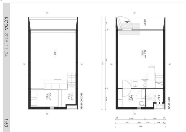
Figure 15 : KODA, Kodasema Architecture, Estonia, 2016. 80

Being multifunctional, all the furniture was made specially keeping the client's needs in mind. Interior walls are covered with wooden panels while a spacious environment was created with the shades and type of wood of the panels used on the walls and floorings. In contrast, dark color wood and fabrics of various textures were chosen for furniture. Black color materials were used in wet areas and are distinguished from the living space with the approach of dark in light. The light-dark relationship adds a different mood to design in terms of color and spatial approach. (Figure 16).