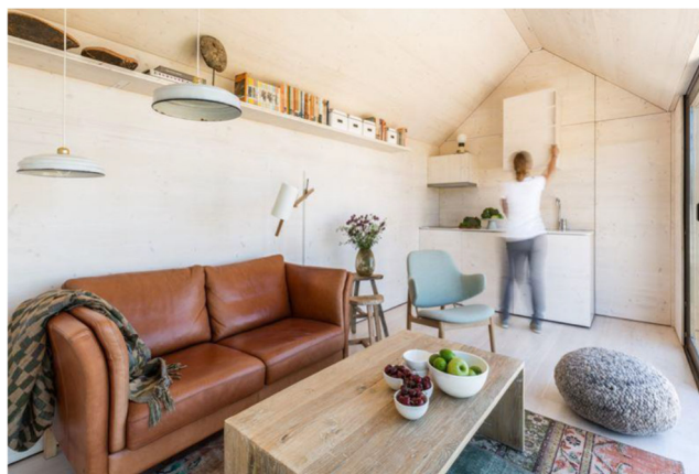
Figure 7 : Portable House APH80, Abaton Arquitectura, Spain, 2013.

Another good characteristic of the building is that most of the materials used are in fact recycled materials. The re-use of the recycled materials when building, and the dimensions of APH80 make us consider it as an environment-friendly house.