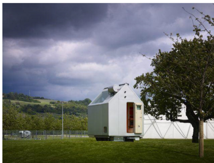
Figure 8 : Diogene, RenzoPiano, Vitra Campus Germany, 2013. 75

The building Diogene is situated within Vitra Campus where the works of famous architects having timeless designs such as Zaha Hadid, Frank Gehry, Nicholas Grimshaw, Tadao Ando and Alvaro Siza are also located. (Figure8)