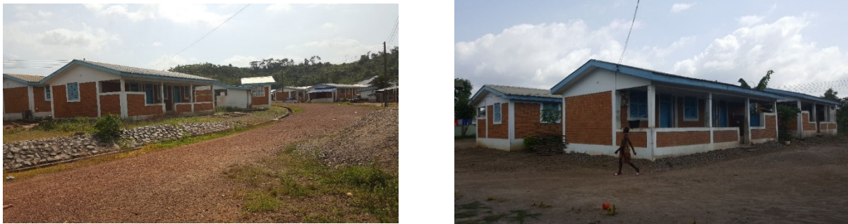
Figure 4: The new Salman Town