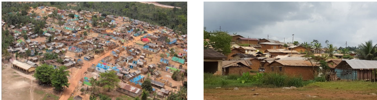
Figure 2: The old Salman Town

The physical layout of the resettlement, which involved the spatial planning of a 101.17-hectare land located about 1.5 kilometres east of the old Salman town, is illustrated in Figure 3. The basis of the replacement of the buildings was “room for a room” or “structure for structure”. For example, a house with one room was replaced with a one-room structure, and an owner of a house with two-rooms had a two-room apartment as a replacement. The new homes had standardised room sizes of 3.66m x 3.66m for all existing rooms that were 3.66m x 3.66m or less, whereas old apartments, which were larger than 3.66m x 3.66m, were substituted with standardised sizes of 3.66m x 4.57m. The dimensions of the land allocated for each house ranged from 3.66m x 3.66m to 21.34m x 30.48m, depending on the number of rooms in the old house.