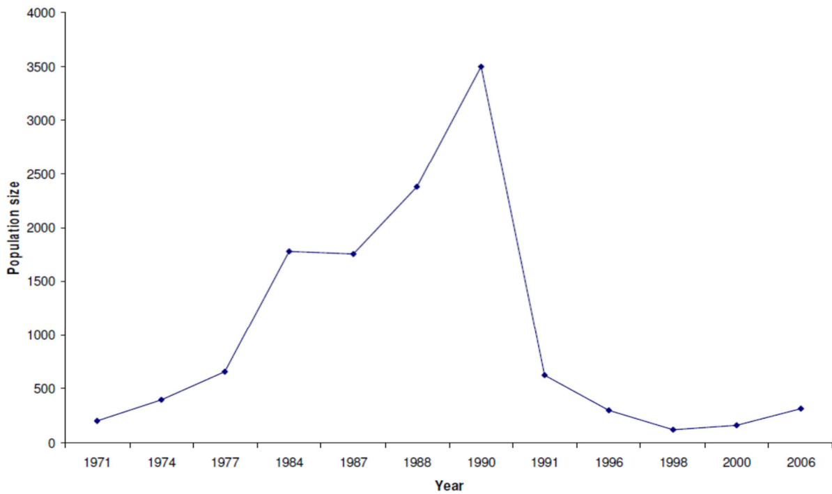
Figure 1. Population trends of Swayne's hartebeest between SSHS from 1971 to 2006.....