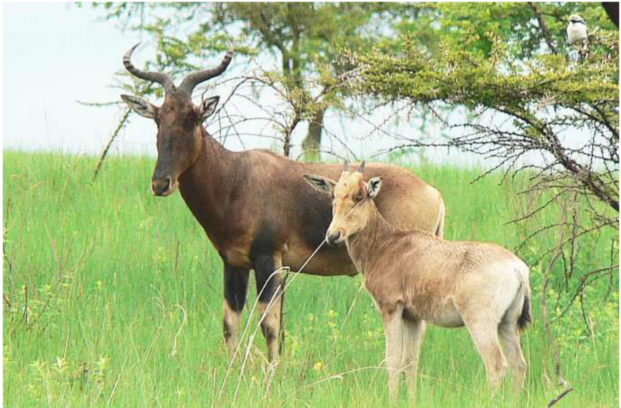
Figure 3 : Swayne's Hartbeest, Alcelaphus buselaphus Swaynei , cow with calf