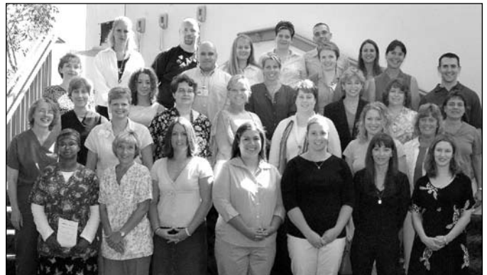
2005 Nursing Scholarship Recipients

CCPD staff welcomed and conducted general orientations for more than 600 new members in the Department of Nursing in 2005 and 2006.