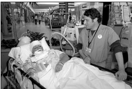
2005 Maine Mall

(Please see page 57 for a complete listing of MMC nurses’ community involvement.)