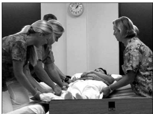
CNA students learn proper technique for lifting patients.