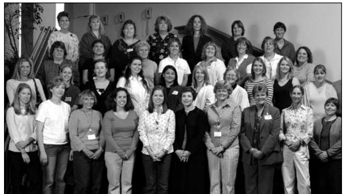
2006 Nursing Scholarship Recipients