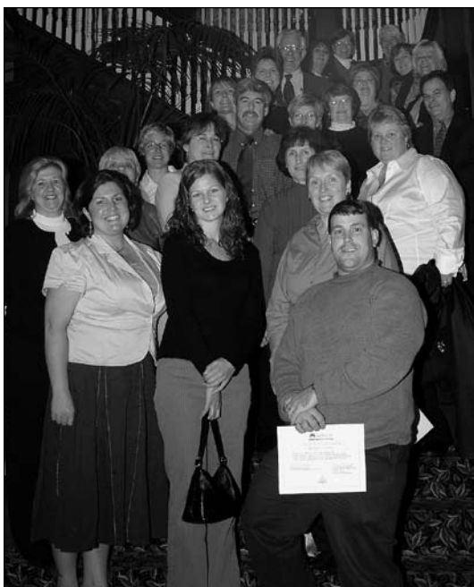
Hearst Scholars participants