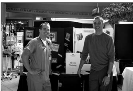
2006 Maine Mall