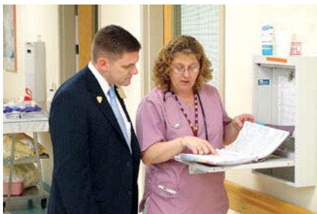
Magnet Site Visit